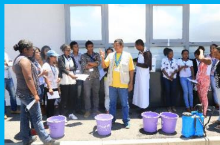
A UNICEF staff member trains a group of volunteers on disinfection techniques