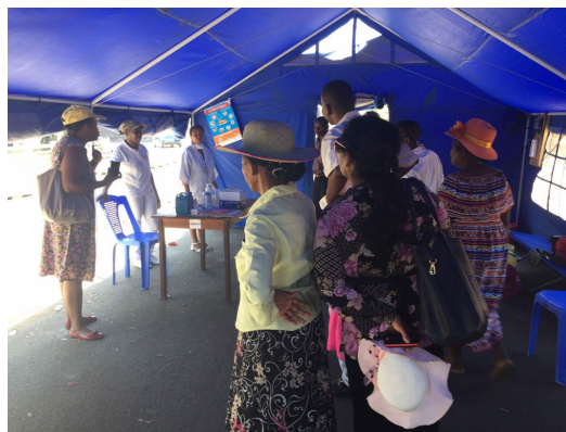
An awareness raising session on plague for community health workers in Tamatave