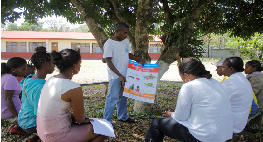
A UNICEF supported plague sensitization session in Tamatave