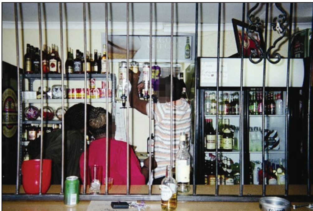
Bottles of alcohol on display