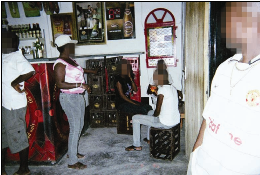
Man watching girls in a bar

However, this strategy does not always work. Sometimes the men follow the women and demand sex from them. Interviews in Katutura show that these men can become violent and beat the women if they catch them while they are trying to escape.