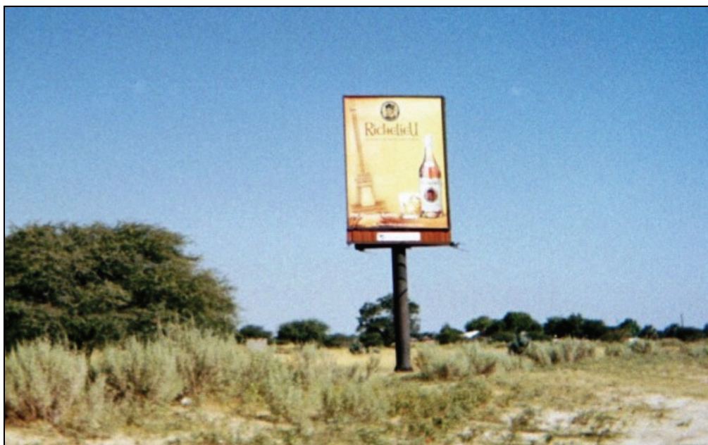
A billboard in the Oshakati Research Site

UNICEF (2007) reported that among those who drink, a Namibian drinks on average 10 liters of alcohol a week. UNICEF (ibid.) notes that alcohol is prominently displayed in the mass media (such as the billboard shown in the image below) and is easily available throughout the country.