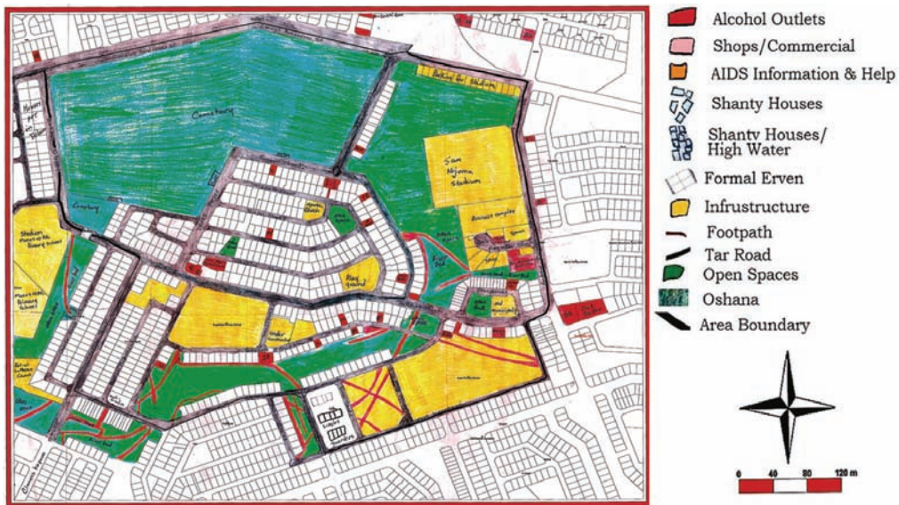
Figure 2 Map of Drinking Places in Dolam

With the exception of women’s household shebeens and tombo houses, bars are owned by men, but bartenders are women who sell the drinks and interact with patrons. Women who own shebeens are usually unmarried and run the bars with an iron fist. When Meme Maria at the Babylon tombo house wanted quiet, she raised her voice in what could only be described as a muffled growl, and all fell silent. She put both old and young, men and women, in their place.