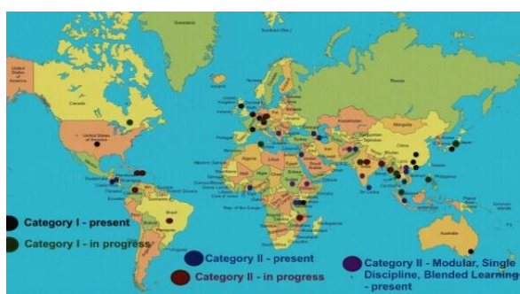
Figure 2: Number of training centres now.

These training Guidelines were published to help transform the capabilities of the workforce, however, there remains no product to address the wider needs of prosthetics and orthotics services. This past training guideline was training specific and did not emphasise the whole service landscape or the whole workforce. There is a pressing need to address this situation by publication of WHO Standards for Prosthetics and Orthotics Service Provision to cover the whole of prosthetics and orthotics provision – delivery system, product, workforce, and policy. Such Standards will focus on a one-world approach to address both the pressures of demographic change and the low quality of services.