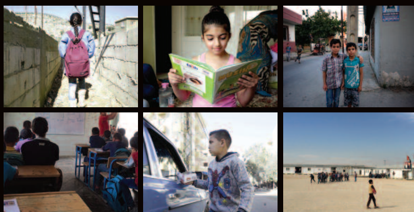
Syrian children and schools in Turkey, Lebanon, and Jordan.

The report identifies shortcomings in donors’ transparency, and demonstrates why addressing these concerns is needed to realize refugee children’s right to an education.