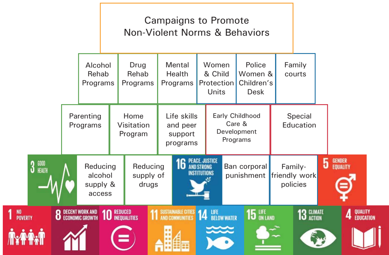
Impact Pyramid for Interventions for Child Physical Violence (Adaptation of Frieden's Health Impact Pyramid, 2010)

The following illustrates and discusses how the population impact framework is applied to addressing child physical and sexual maltreatment: