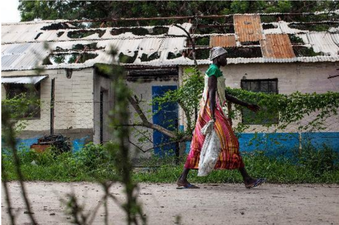
A woman walks on 7 July 2014 past one of the buildings of the Leer Hospital that was burned during the fighting. Hundreds of thousands of people were cut off from critical, lifesaving medical care after the Leer Hospital, run by Médecins Sans Frontières (MSF-Doctors Without Borders), was ransacked and destroyed between the final days of January and early February.

South Sudan, with support from international donors, must take steps to increase the availability, accessibility and quality of mental health services for survivors of sexual violence.