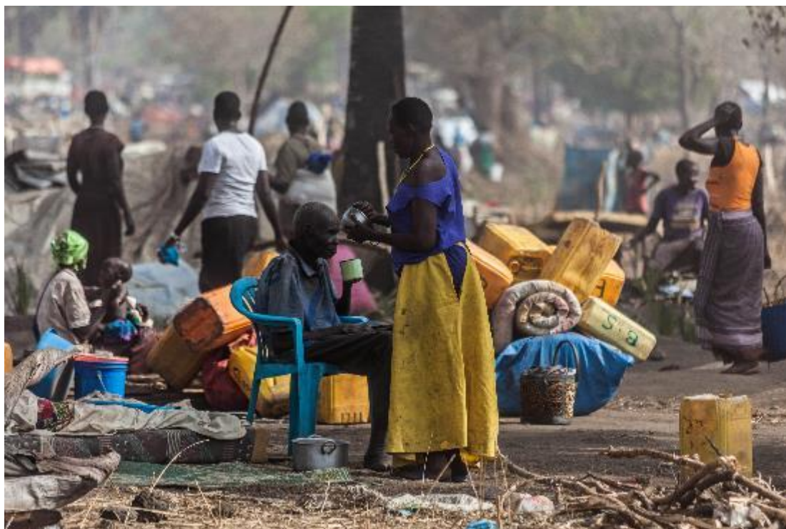
Palorinya refugee settlement in Moyo district, Uganda, 2017.

The conflict has taken an enormous toll on civilians, costing the lives of an unknown number of people. 22 Approximately 1.9 million South Sudanese are internally displaced, with over 200,000 living in camps – called Protection of Civilians (PoC) sites – protected by UN peacekeepers and on UNMISS bases. 23 Another 1.6 million people have fled their homes and sought safety in neighbouring countries as refugees. 24 An estimated 4.9 million people – more than 40% of the total population – are food insecure, and in February 2017, famine was declared in Leer and Mayandit counties. 25 Civilian access to humanitarian assistance is constrained by the ongoing fighting and by intentional obstruction of humanitarian access by parties to the conflict, particularly the government. 26