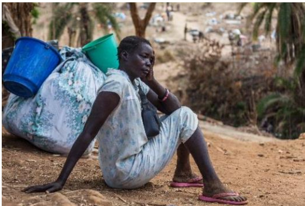
A woman rests next to her luggage before crossing Kaya stream near Afoji town, Moyo district, northern Uganda.

Attacks between government and opposition forces have resulted in the mass displacement of civilians and emptied entire towns and villages in Yei, Lainya, Kajo Keji, Morobo and other towns close to the Uganda and Democratic Republic of Congo border. 162 In December 2016, the Commission for Human Rights in South Sudan said that there was already a steady process of ethnic cleansing under way 163 and that the Equatoria region had become the epicentre of conflict. 164 Uganda is hosting over 900,000 South Sudanese refugees, out of the 1.5 million being hosted within the region. Thousands of refugees continue to cross the border into Uganda each day – in March 2017, the average number of new arrivals was 2,800 per day. 165 Refugees in northern Uganda who had fled Central Equatoria described to researchers for this report acts of sexual violence perpetrated both by government forces as well as by the opposition.