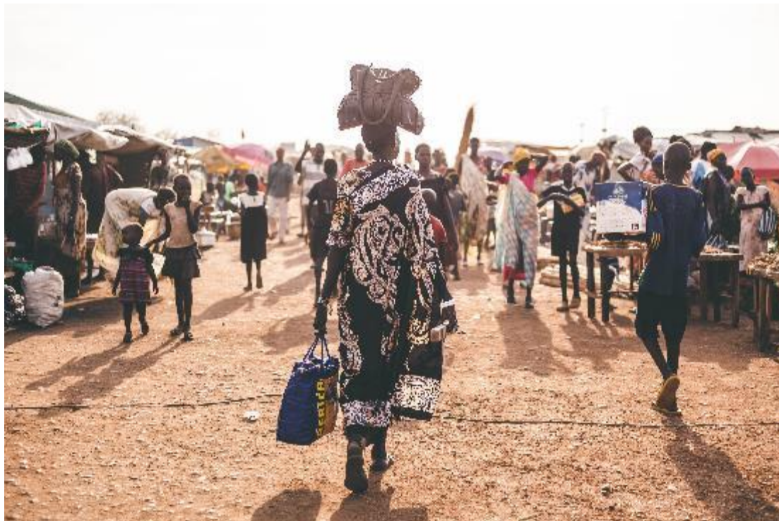
A woman carrying luggage on her head walks through the Protection of Civilians site in Juba, South Sudan.

Most of the cases investigated for this report involved rape or gang rape of women and girls, which often lasted for hours and left victims with serious injuries – both physical and psychological. Some rapists aggravated their crimes by other acts of cruelty, such as mutilating victims with knives or raping them with objects such as sticks. Some killed their victims outright while others left them bleeding, seemingly indifferent to whether they lived or died. Elderly women, young girls, and pregnant women have not been spared.