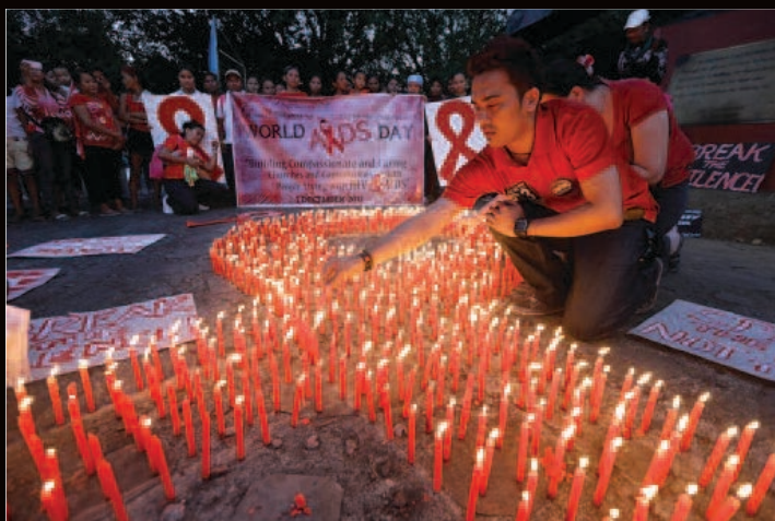
Filipinos light candles, which are shaped into an AIDS symbol, to mark World AIDS Day on December 1, 2012, in Manila, Philippines.

Human Rights Watch calls on the Philippine government to remove legal and policy obstacles to condom access, and remedy the dangerous deficit in public awareness of safer sex and HIV prevention methods through education programs on condom use in public and private schools.