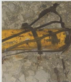
Karm al-Jazmati, Aleppo, November 23, 2016