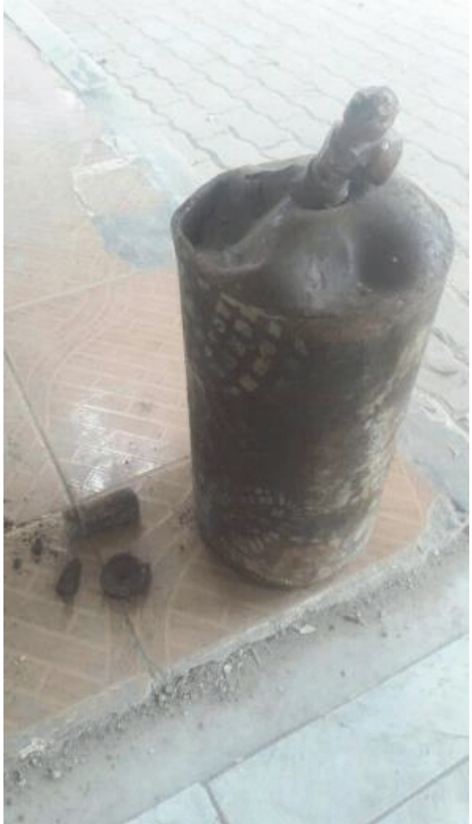
Deformed gas cylinder that a Syria Civil Defense member said was found at the site of a March 29 attack in the Qaboun neighborhood in eastern Damascus, which is controlled by armed groups fighting the government.

On February 9 and 10, 2017, at least six members of an armed group were injured from exposure to chlorine, according to a