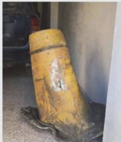
Tariq al-Bab, Aleppo, November 20, 2016