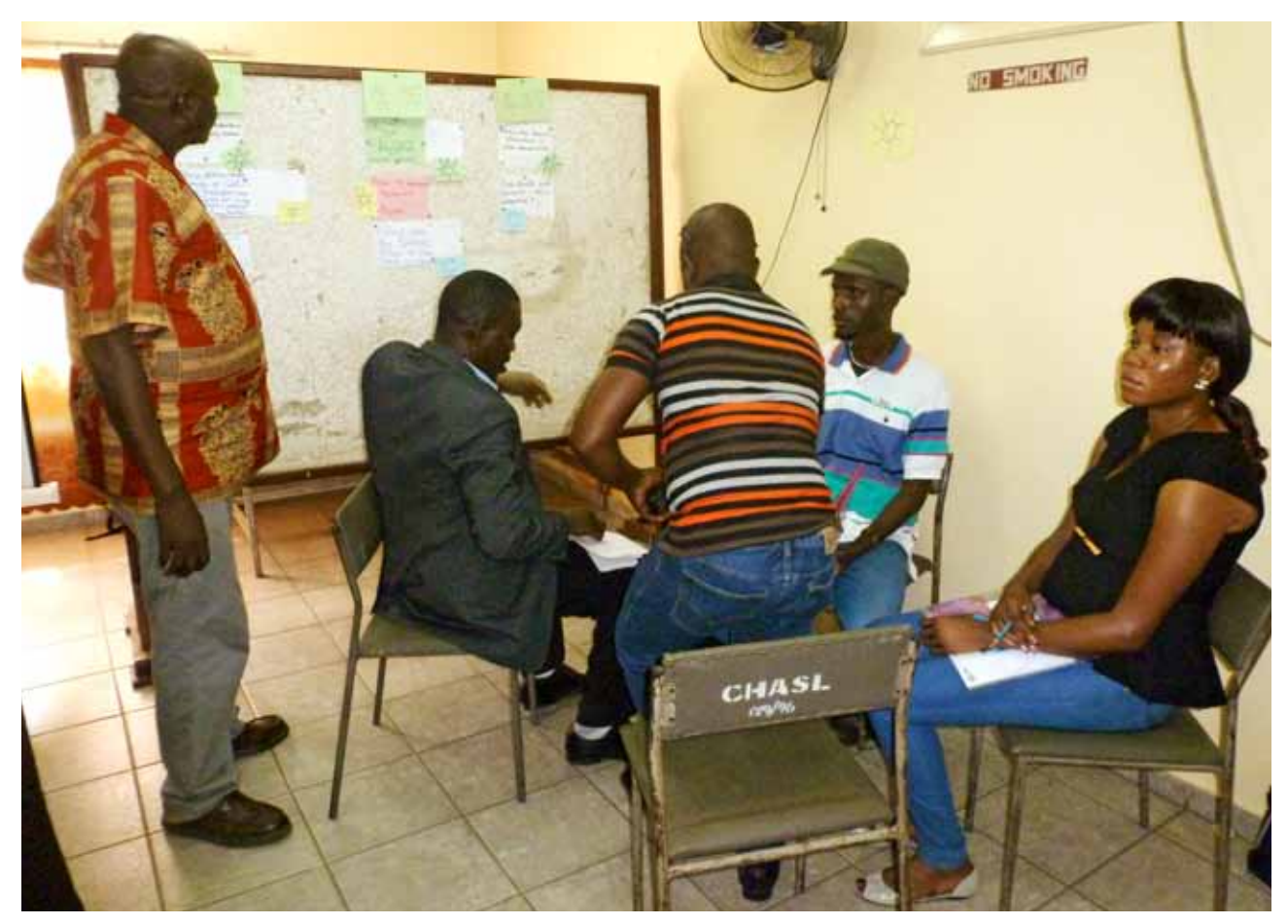
Training of Open Space Team Assistants in Sierra Leone

text community contributions were also discussed. Guinean, Liberian and Sierra Leonean participants were all of the opinion that communities can provide or facilitate accommodation and access to food for staff of their health facility as incentives to remain at their postings. Yet, community members among participants stressed their expectation that the relations between communities and the health workers would have to be intensified in order to really bring a change for the better in service provision.