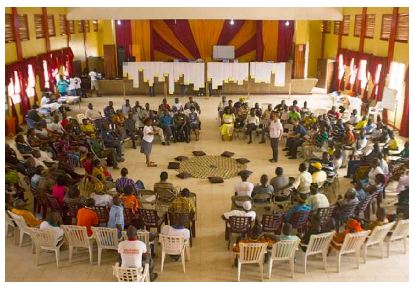
The OSC begins