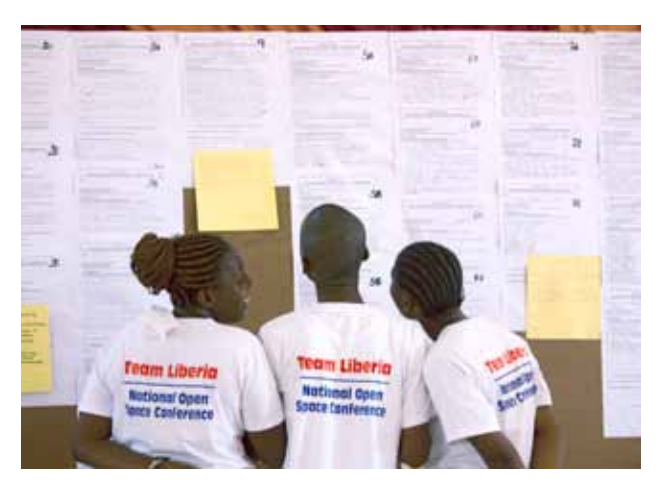
OS-Team puts up group work results

the needs of disabled people. The national code of conduct for health personnel should include respectful and appreciative communication and behaviour towards people living with a disability. Someone capable in sign language should be available in each community for the deaf. Participants also called on the Ministry of Gender, Social and Child Protection to consult more closely with the National Union of Organizations of the Disabled (NUOD) on issues pertaining to disability. Last but not least, the participants suggested free medication and prioritized treatment at health facilities as measures that would facilitate a life with a disability.