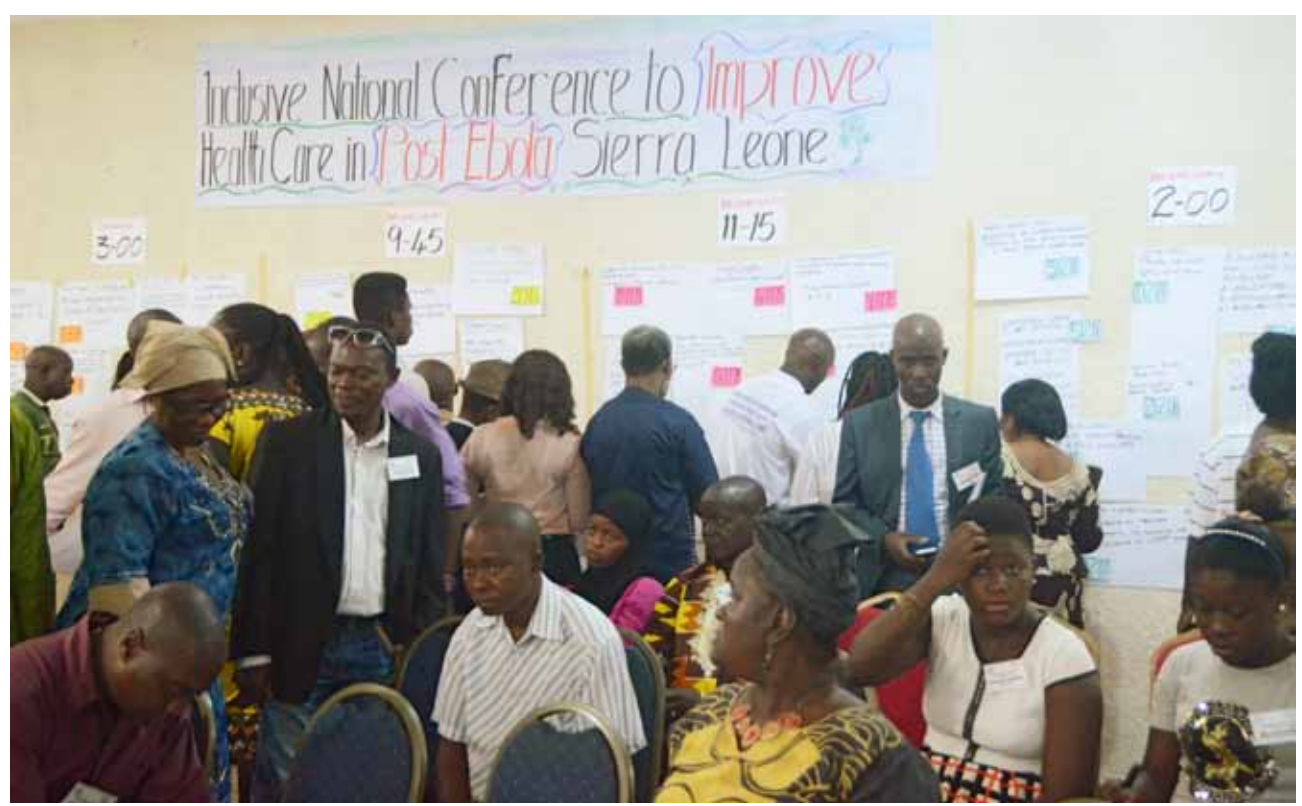
Participants select their discussions according to their interest

areas for sand harvesting or to promote the usage of wonder stoves.