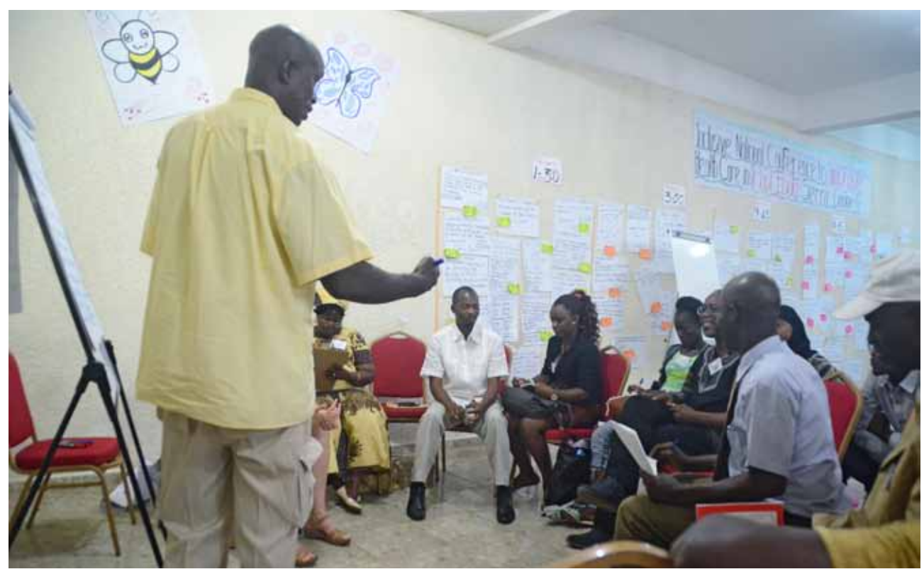
Groupwork for bees and butterflies: participiants acting as bees diligently nurture the discussion; participants acting as butterflies take ideas from one group to another

Another issue raised was the national health information system that poses challenges in rural settings. Registries and reporting forms are insufficiently supplied, computers and internet are not available, and capacities and competences on reporting are weak. This situation could be improved by government and development partners through simplification and harmonization of reporting tools, more training, incentives for reporting and the time-