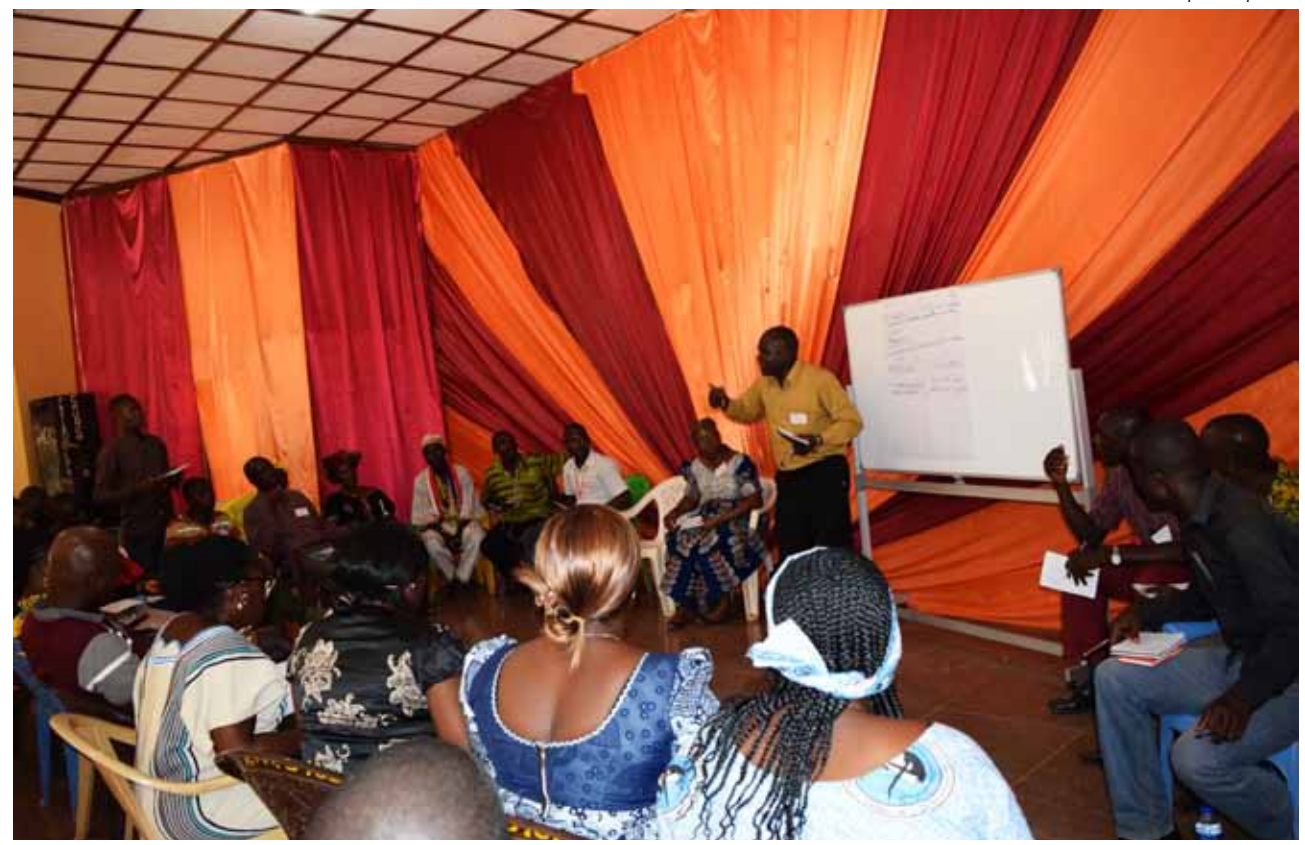
Fasciilitation and documentation is in the hands of participants

Participants called on government and communities to improve barrier-free access to health facilities including sidewalks on roads and ramps. Health staff should also be better trained with respect to