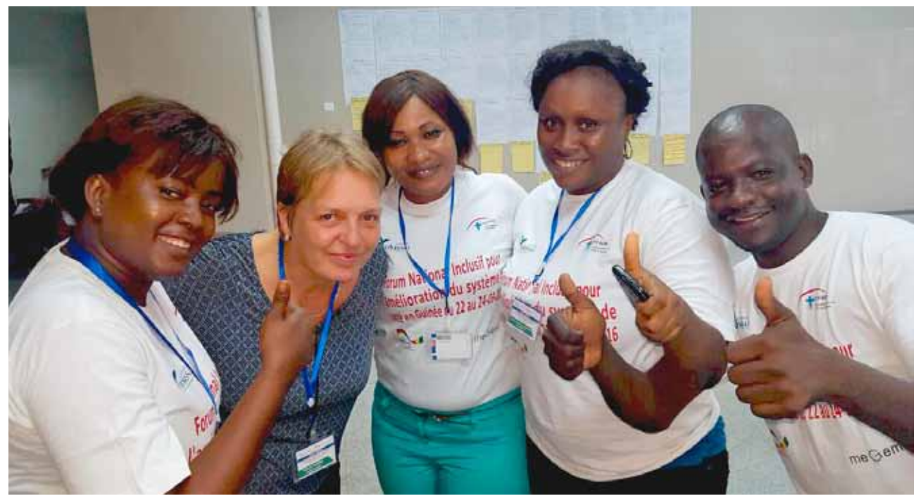
Open Space team assistants and facilitators in Guinea

Community involvement and contribution can be seen as key to sustainable change and improvement even if means and wealth of communities are limited. Community participation fosters ownership and ownership triggers community investment even if it has to remain in-kind. The process of rebuilding and strengthening the post-Ebola health systems of Guinea, Liberia and Sierra Leone should factor in community force in health. The Open Space Conferences have shown that energy and interest is endless if people have the feeling that their opinion and their ideas count.