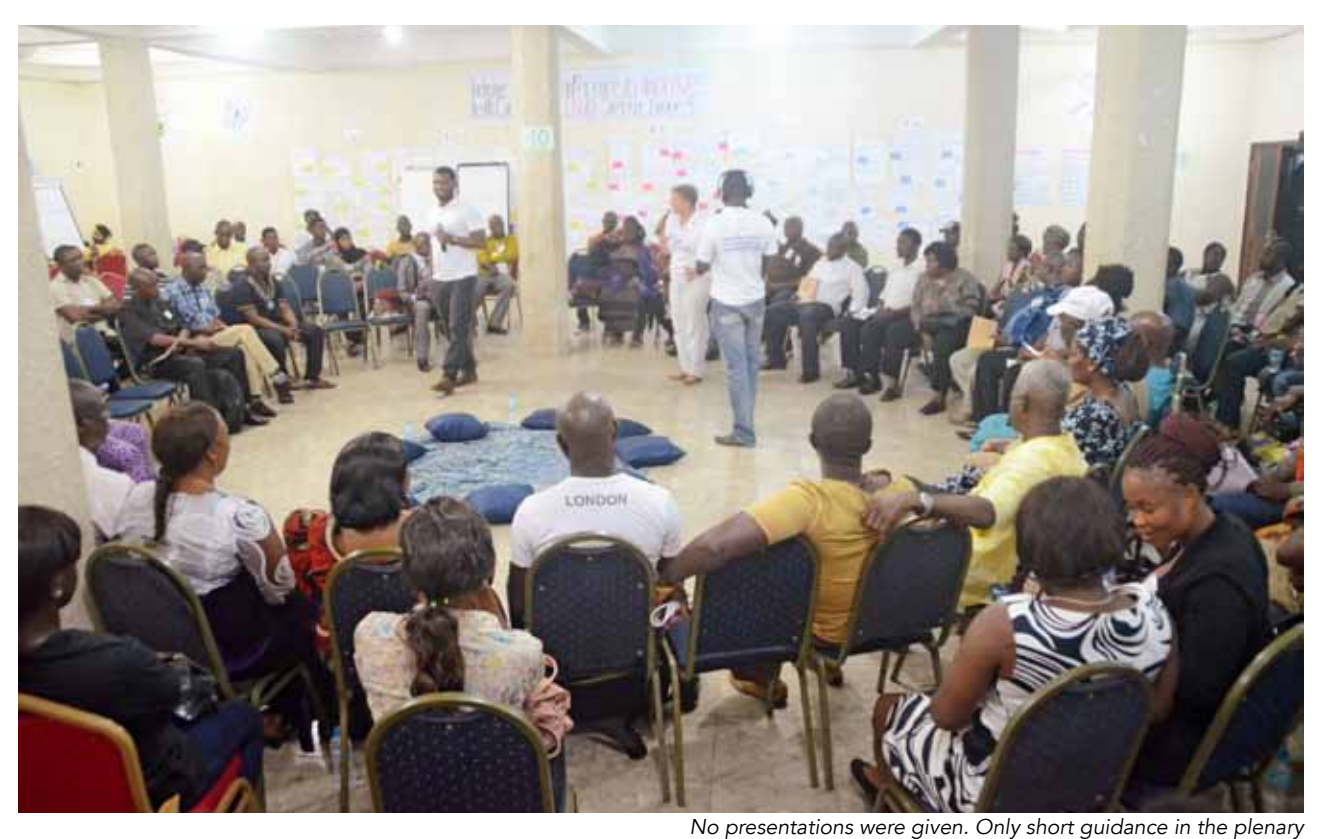
No presentations were given. Only short guidance in the plet