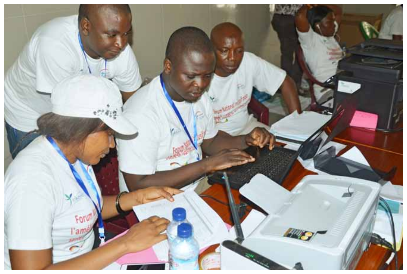
Team assistants support the proceedings of the conference