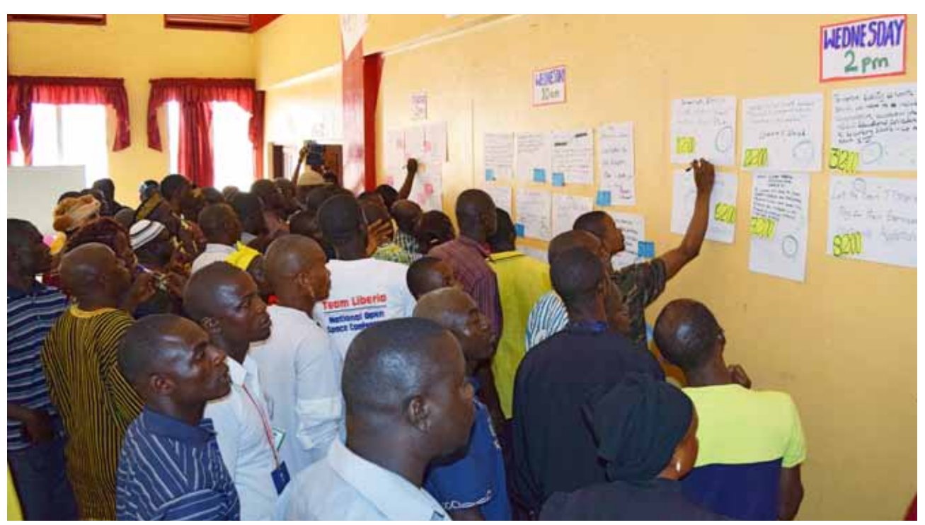
Participants select the discussion groups for their topics of interest