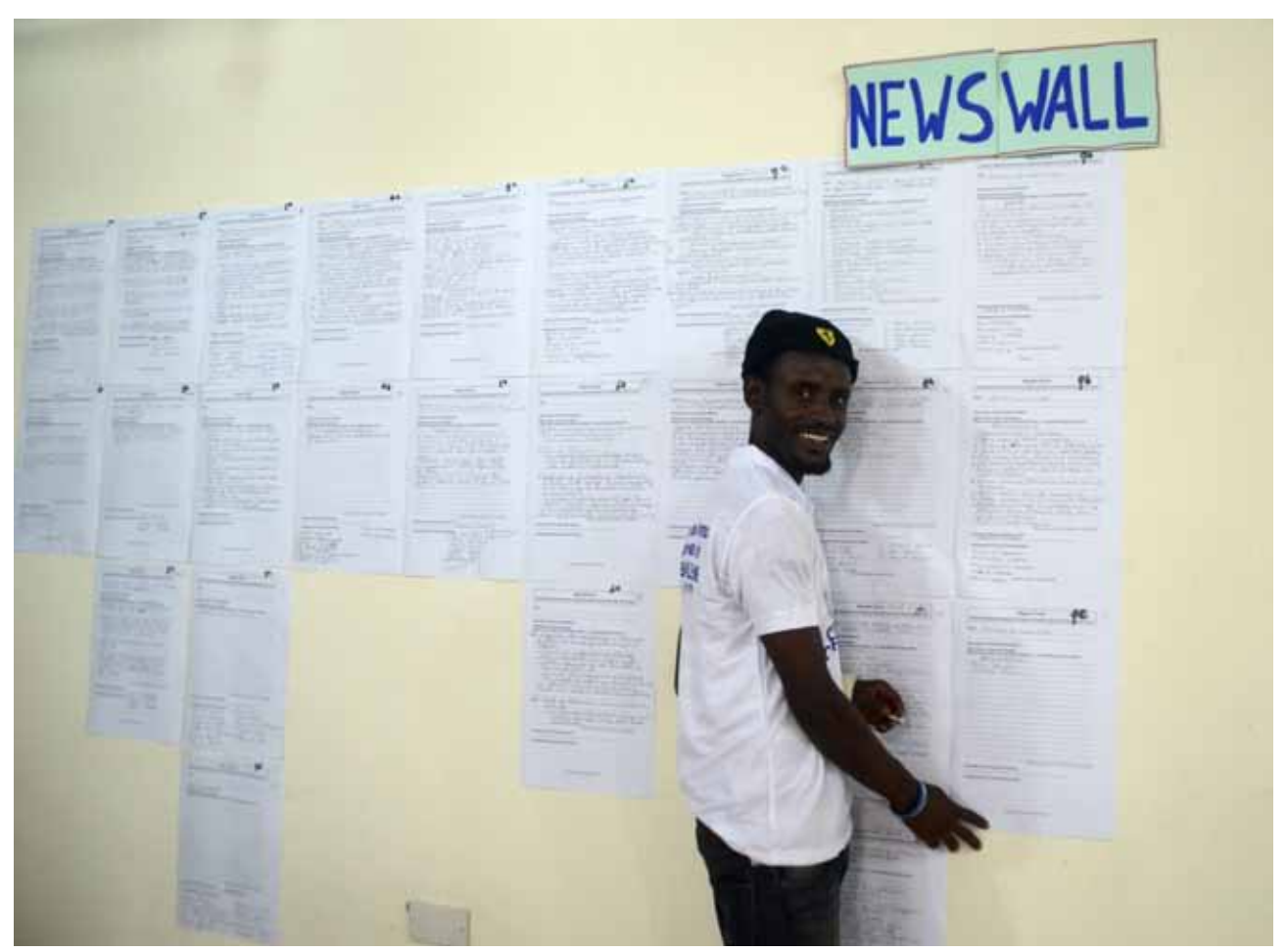
The newswall displays all groupwork reports

suggested that traditional birth attendants should be trained to take over part of these tasks. Community Health Volunteers should be encouraged to take pregnant women to the hospital in emergencies. Vaccines should be available in good quality to both, women and infants. Last but not least, health workers should foster cordial relationships with the female patients.