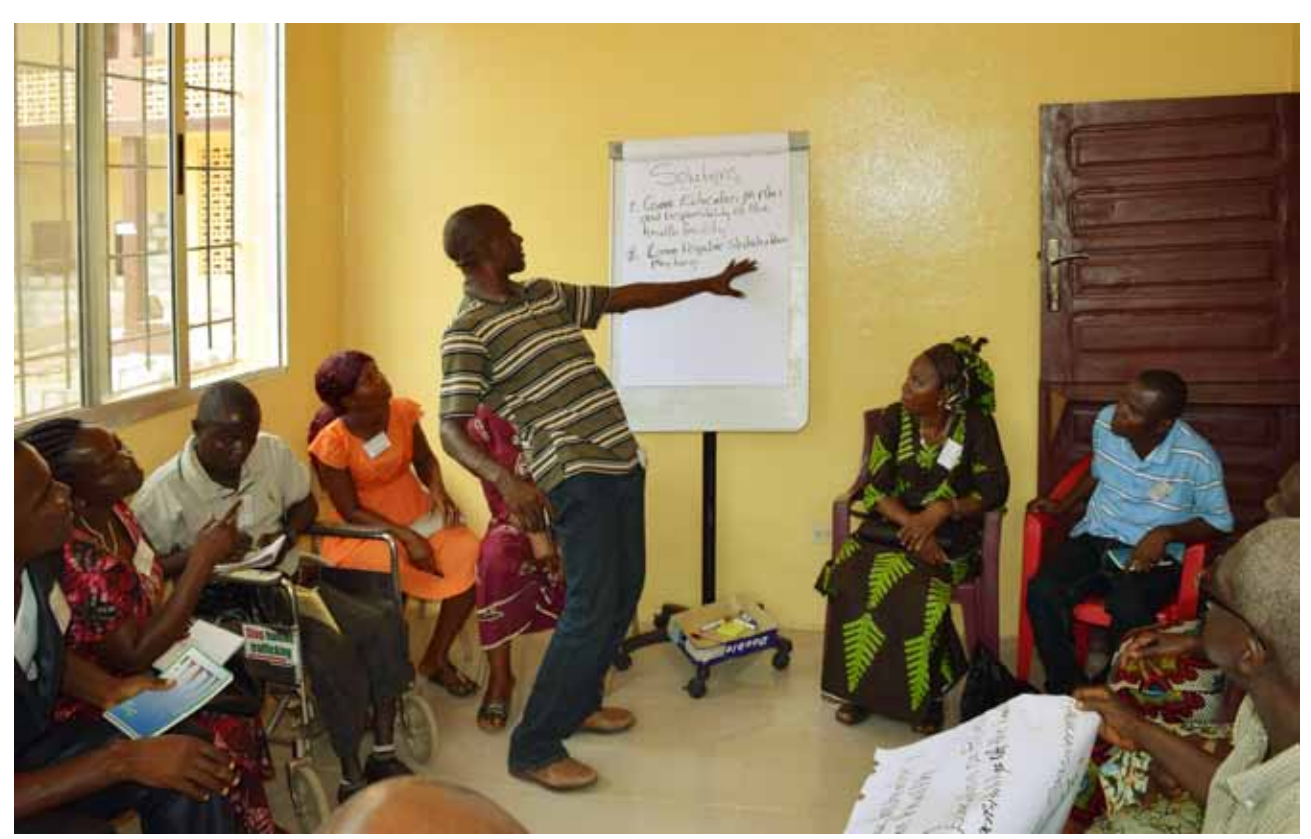
All discussion results are noted on flipcharts and paper sheets

Ebola survivors and community members remains challenging. More awareness and sensitization on the suffering of Ebola survivors are needed. People affected by Ebola need psychosocial counselling and encouragement.