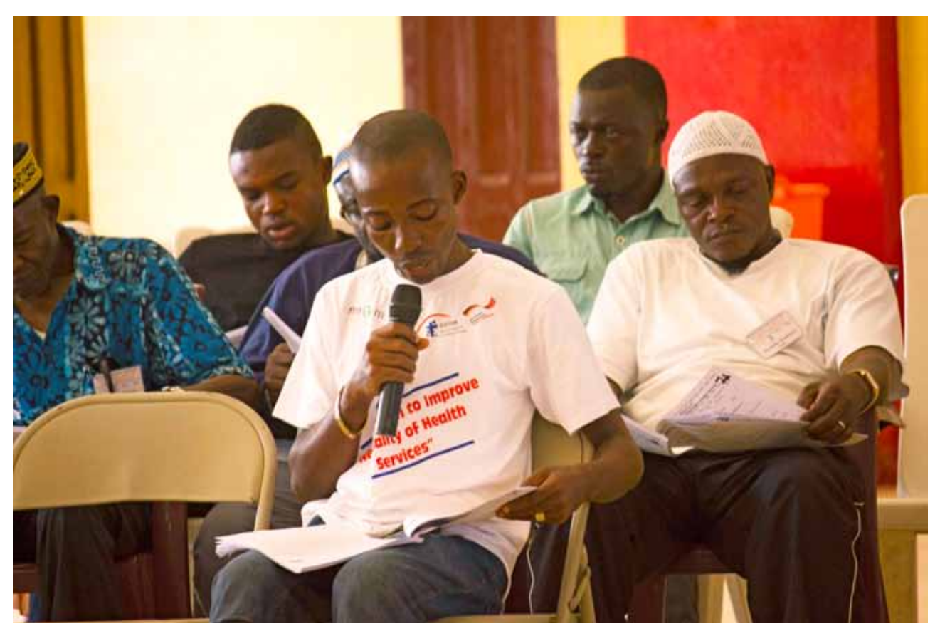
An Open Space Team Assistant reads the Book of Proceedings to participants

health facility. Communities can contribute to the health volunteer system by exempting volunteers from communion works as an incentive. In addition, community leaders can support health promotion conducted by GCHVs by gathering residents for educational sessions.