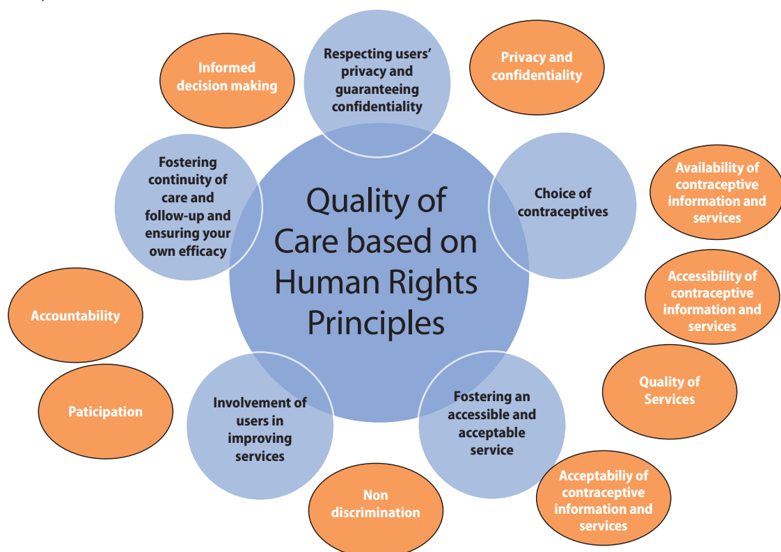
Diagram: The relationship between quality of care and human right

As the schematic below highlights the high degree of overlap between the approaches, both are mutually dependent and reinforce each other. While the human rights based approach reinforces a quality of care approach by adding elements such as non-discrimination, accountability; the quality of care approach emphasises the importance of putting the user and experience of care at the centre. Human rights and quality of care are mutually reinforcing concepts and should be implemented in an integrated manner. Policies, programmes and interventions which do espouse to build quality of care based on human rights considerations are likely to have more sustainable outcomes. This checklist is an initial attempt to achieve this integration in the provision of contraceptive services and information at the facility level.