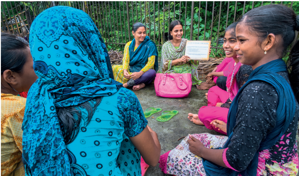
Sex-workers from Bhashantek area having a group session in a railway station platform.

choices about their health and wellbeing in supportive families and communities. This is achieved through face-to-face discussions with peer educators, training and community events to raise awareness as well as through the direct provision of health care, with the support of Marie Stopes Bangladesh and other partners.