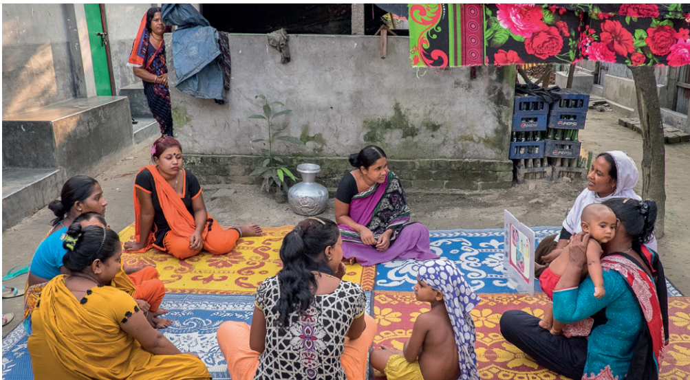
A group session for awareness raising at Doulatdia Brothel.