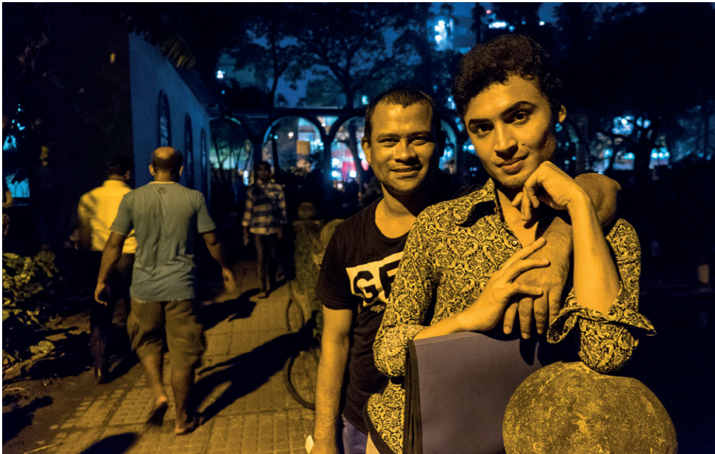
A group of MSM members and Link Up beneficiaries, meet up for a group session at Laldighi Park, Chittagong.