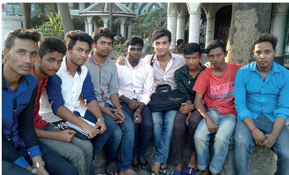
An MSM group in the park in Chittagong.