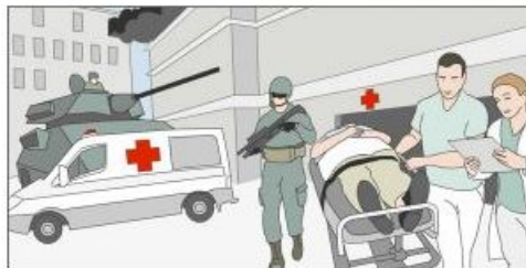
Crisis at the district hospital