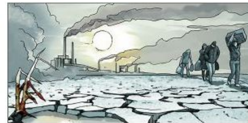
Climate change and health