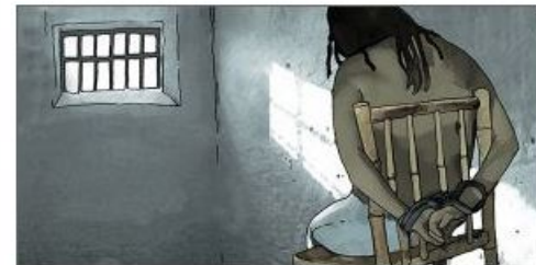
Healing torture victims