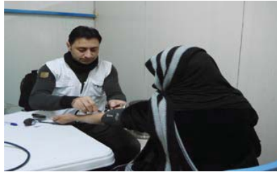
Taking vital signs in the triage room, Gawilan camp Primary Health Centre, Iraq

Access to reproductive health care services remains a key concern across the region with around four million women and girls of reproductive age assessed to be in need of special attention. Among children, improvement of health care services for newborns and need for routine immunization against vaccine-preventable illness remains a priority. The need for health and hygiene messaging is also a key focus area.