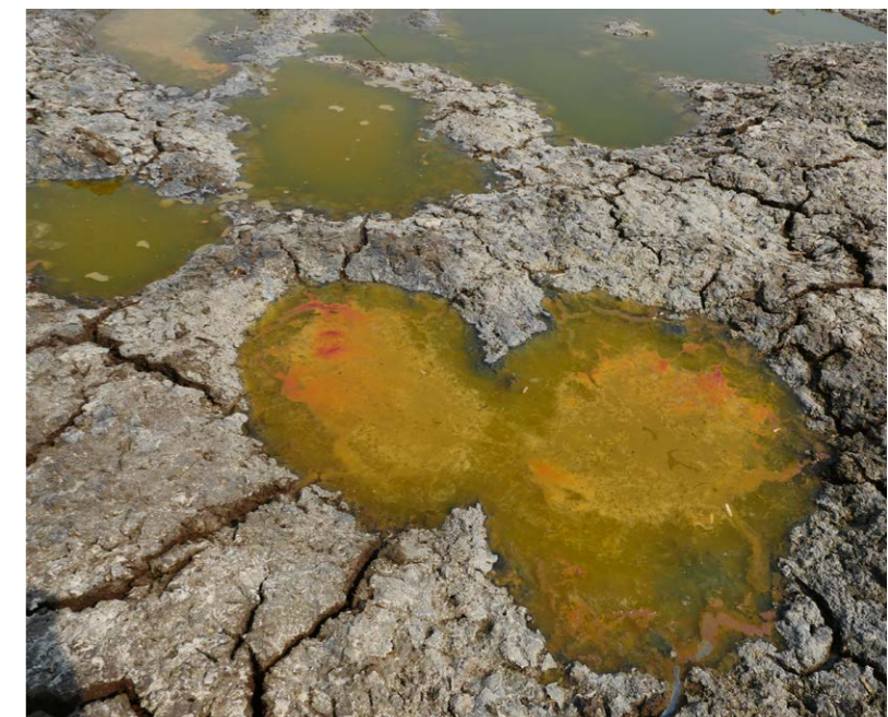
Close-up of chemical pools in lakebed at Kazipally Lake, Hyderabad

As described previously, antibiotic pollution has contaminated many water bodies in Hyderabad, one of the poles of India's bulk drug manufacturing industry. Pharmaceutical pollution has plagued Hyderabad for many decades and shows no sign of abating. In November 2015, the Indian NGO Centre for Science and Environment (CSE) published an analysis showing that 15 of the drug manufacturers operating in the Patancheru-Bollaram cluster on the outskirts of Hyderabad were committing a wide range of environmental violations. 49 In March 2016, a major Scandinavian bank, Nordea Asset Management, issued a report examining the "Impacts of Pharmaceutical Pollution on Communities and Environment in India" 50 in Hyderabad and Visakhapatnam, another pharmaceutical manufacturing hub located in Andhra Pradesh. The report shed light on the behaviour of some of the companies operating there, and investigated links with foreign export markets. Some of the key findings are highlighted below.