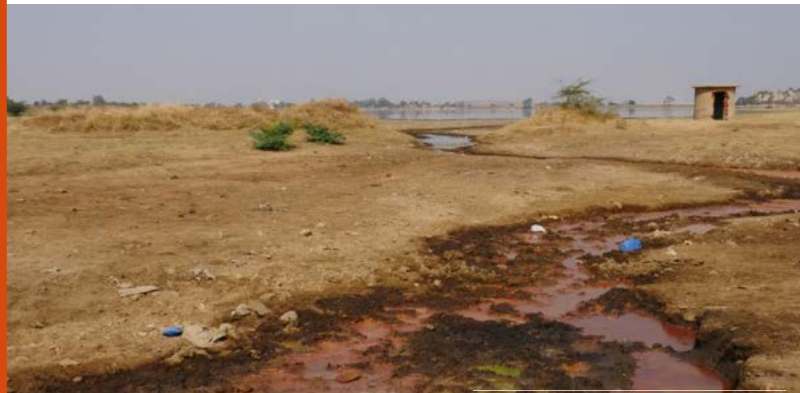
Polluted water flowing into Isnapur Lake, Pashamylaram, Hyderabad. Aurobindo's Unit V is located a few hundred metres from Isnapur Lake, just inside the Patancheru industrial area

The on-the-ground investigation featured in the Nordea report as well as information from CSE indicate that many of Hetero's manufacturing sites are flouting environmental regulations.