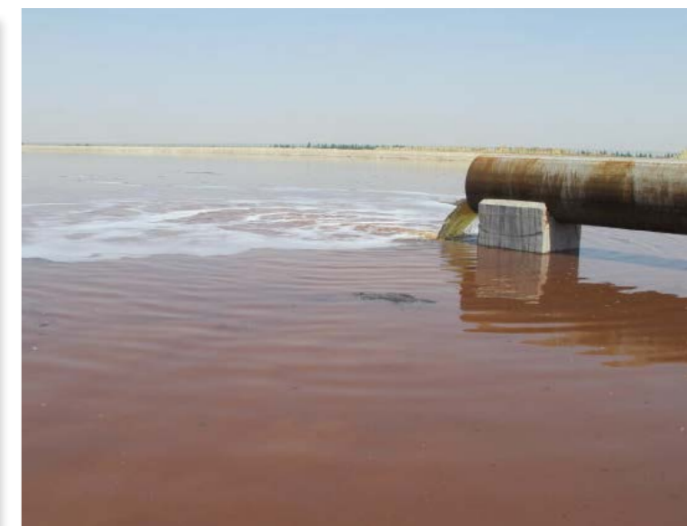
Effluent pipe from Shiyao Zhongrun Pharmaceutical Plant