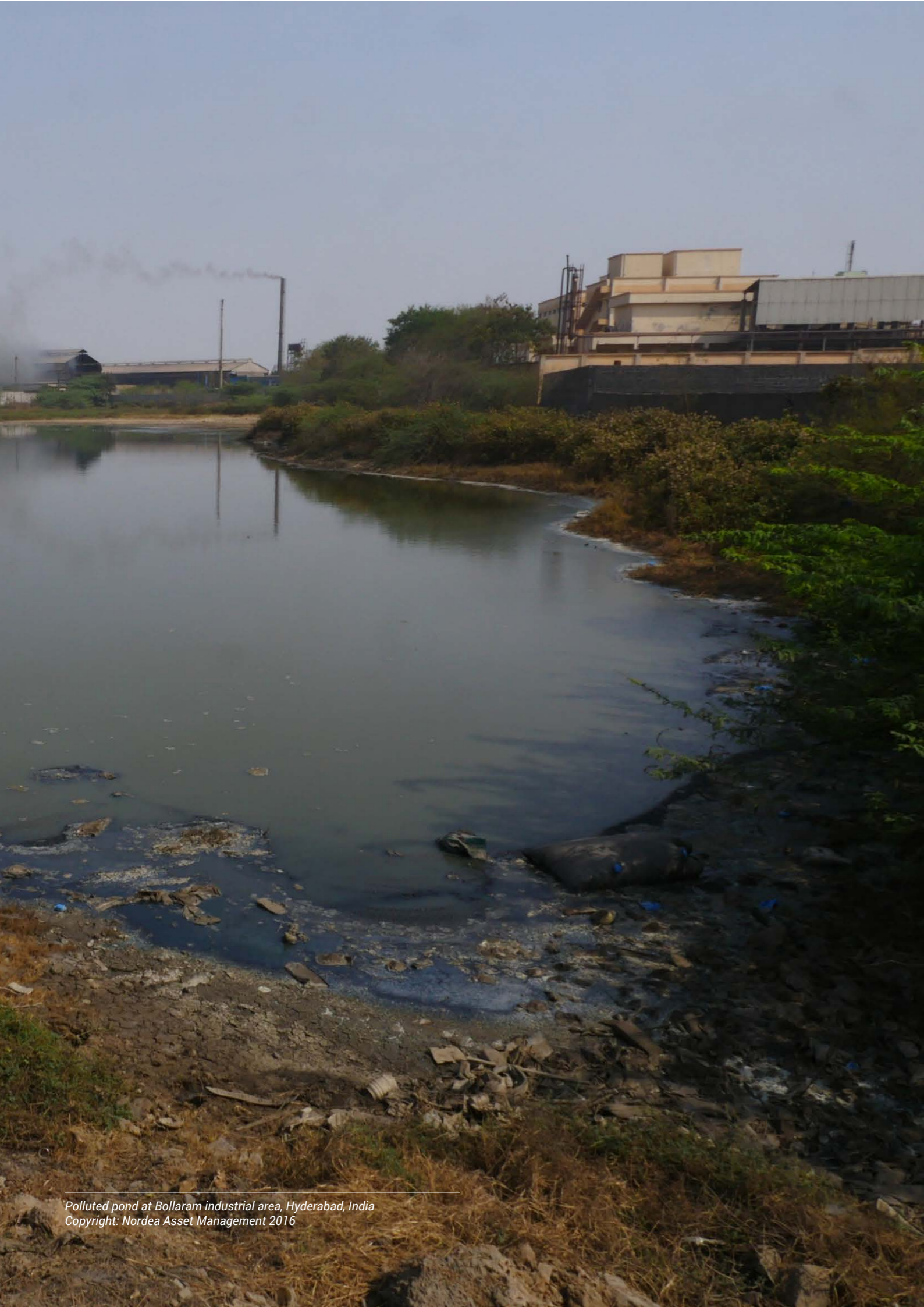
Polluted pond at Bollaram industrial area, Hyderabad, India