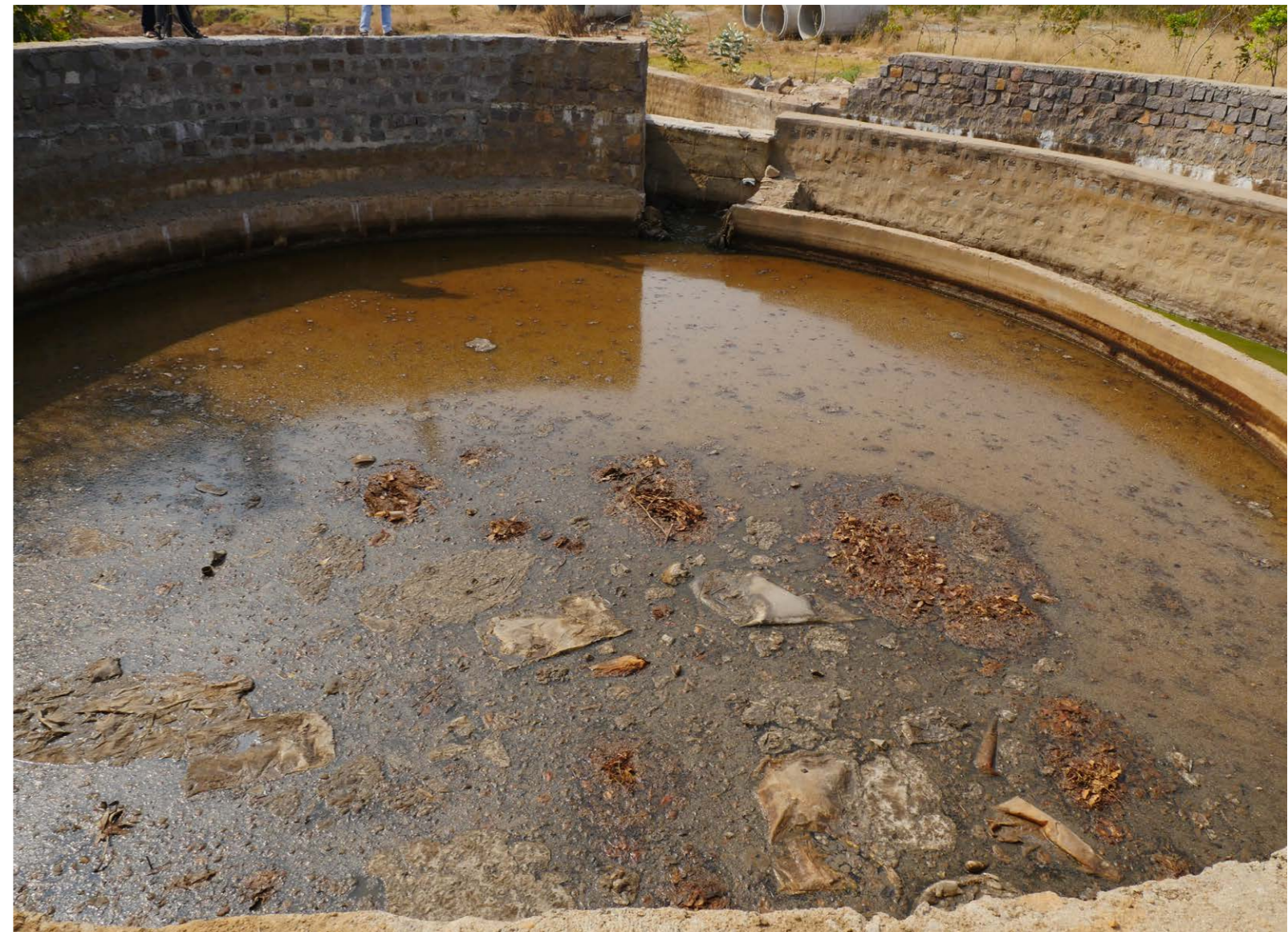
Close-up of an effluent treatment plant at Gaddapotharam, a village on the outskirts of Hyderabad

Antibiotic pollution has also been reported at multiple sites in China, where drug resistance is also a real and growing threat. One recent study reported the presence of the New Delhi Metallo-Beta-Lactamase (NDM-1) antibiotic resistance gene at waste water treatment plants in Northern China. 28 The scientists concluded that there were four to five resistant bacteria leaving the treatment plant for any one bacterium that entered. 29 The NDM-1 gene makes bacteria carrying it resistant to most antibiotics except polymyxins, a group of highly potent drugs whose toxic side effects mean that they are reserved for treatment of only the most serious infections. Since the discovery of the gene in 2008, NDM-1 has been identified in more than 70 countries around the world, demonstrating how quickly resistance is transmitted. 30