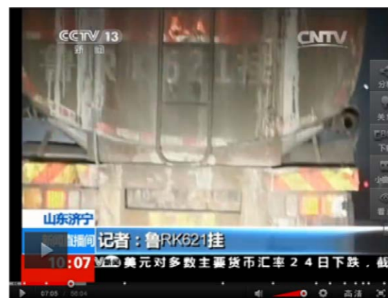
Screenshots from a CCTV report broadcast on Chinese television in December 2014, which revealed that Shandong Province-based manufacturer Lukang Pharmaceuticals was illegally dumping and transporting waste water by truck. Samples taken from the effluent showed high concentrations of antibiotics, with levels of one antibiotic almost 10,000 times higher than clean water samples.

United Laboratories' production line was shut down and others suspended operations for several months.