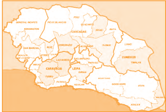
Map of the Republic of Arcadia

At the end of this month, an election will be held to choose mayors in all municipalities. The races have been extremely close, and surveys reveal no clear frontrunner. As a result, candidates have had to increase their campaign efforts to gain votes.