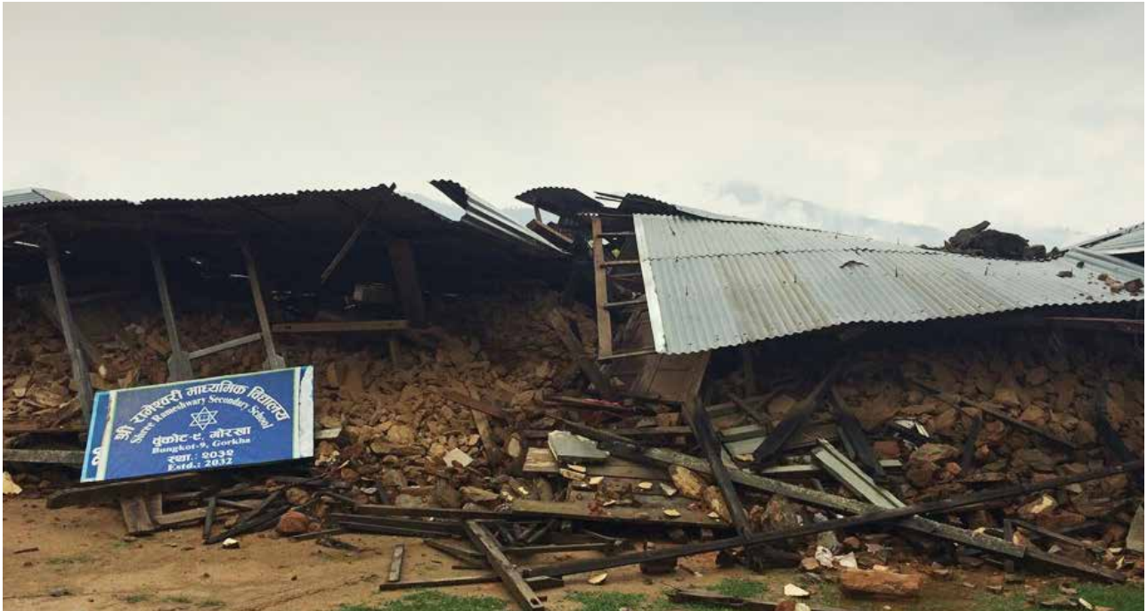
A school in Gorkha completely destroyed by the April 25th earthquake.