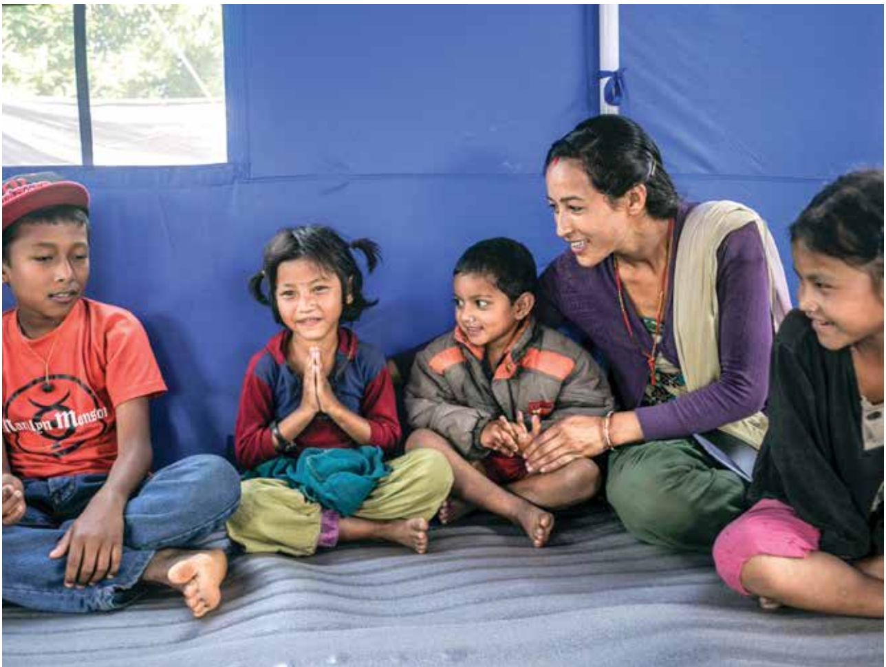
Children attend one of the first Child Friendly Safe Spaces to open in Gorkha