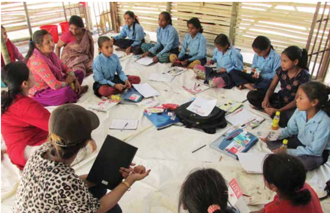
A group of girls share their vision for the future during a consultation with children.

More details of the methodology and a summary of strengths and limitations of the consultation can be found in Annex I.