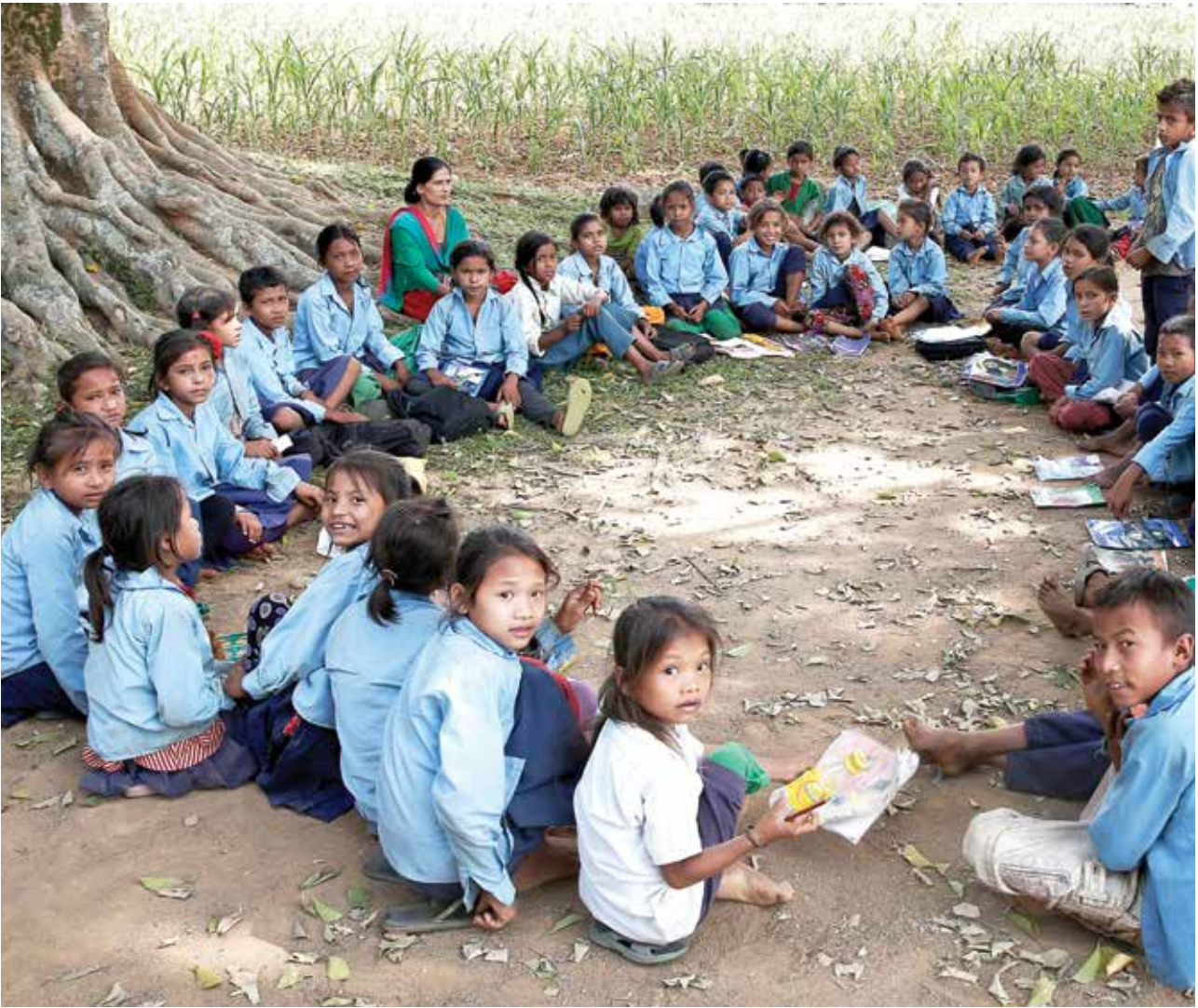
Classes are held under the shade of two trees in Dhading, one of the earthquake-affected districts in Nepal. Following structural assessment post-earthquake, parts of the school compound have been marked unsafe for immediate use without repairing.