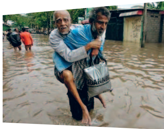
HelpAge Sri Lanka

HelpAge International helps older people claim their rights, challenge discrimination and overcome poverty, so that they can lead dignified, secure, active and healthy lives.