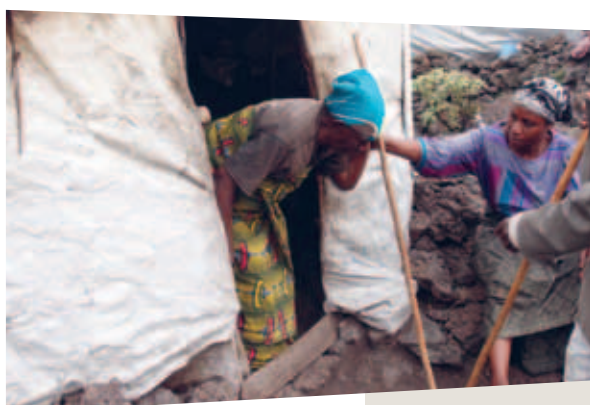
Gacheru Maina/HelpAge International

Developing partnerships and engaging in joint messaging can therefore become a central part of your advocacy strategy, and will likely help you to have a greater impact and obtain more sustainable results. For example, it can be useful to partner with NGOs with a gender-based violence (GBV) or child protection focus to ensure that older people are included in their specific sector of intervention, for instance in contexts where large numbers of older people play primary care roles for children.