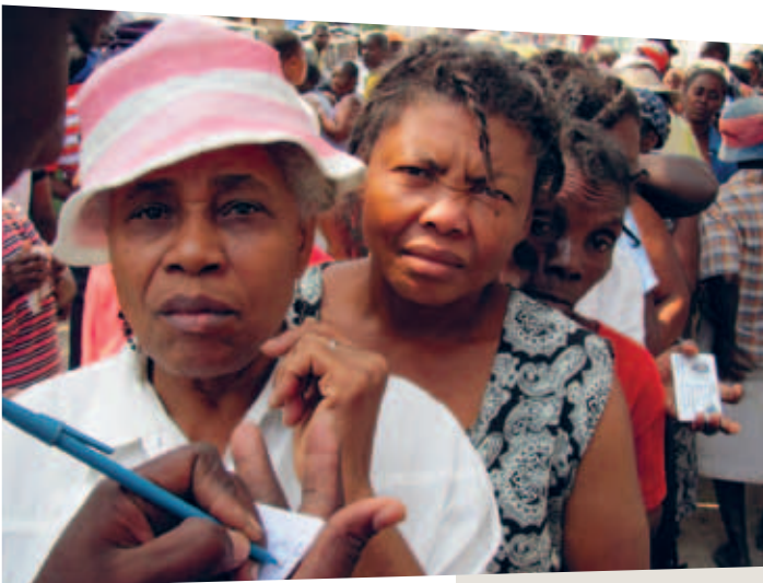
Cindy Powell/HelpAge International