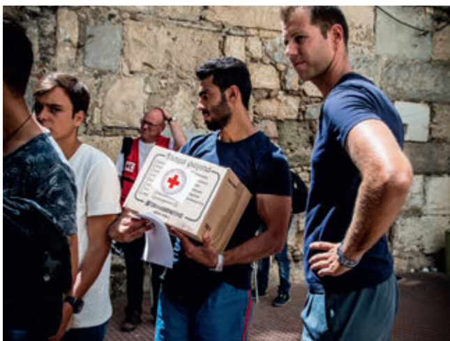
A man prepares to leave the registration centre in Kos, carrying relief items provided by the Hellenic Red Cross.

In their awareness-raising, National Societies will promote respect for diversity and counter intolerance, prejudice and discrimination through a series of positive imaging programmes. These will focus on raising awareness among the local host population on the realities of all migrant experience and the challenges faced by migrants. These programmes will also emphasize the value, talent and contribution that migrants can bring to society and the positive opportunities that global migration presents.