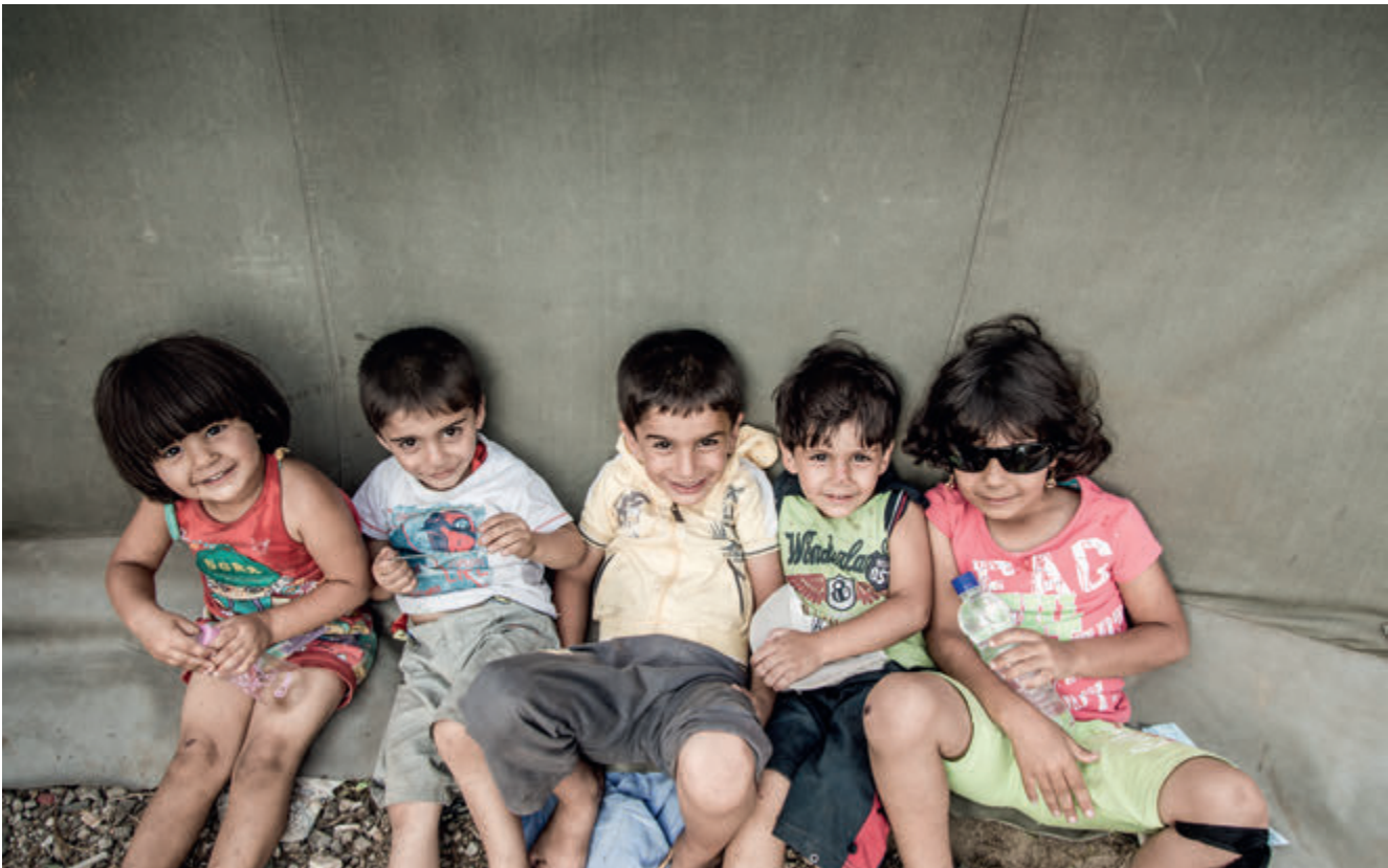
The Red Cross of Serbia has been providing assistance to the country's southern borders and with mobile teams in the north since the onset of the emergency.