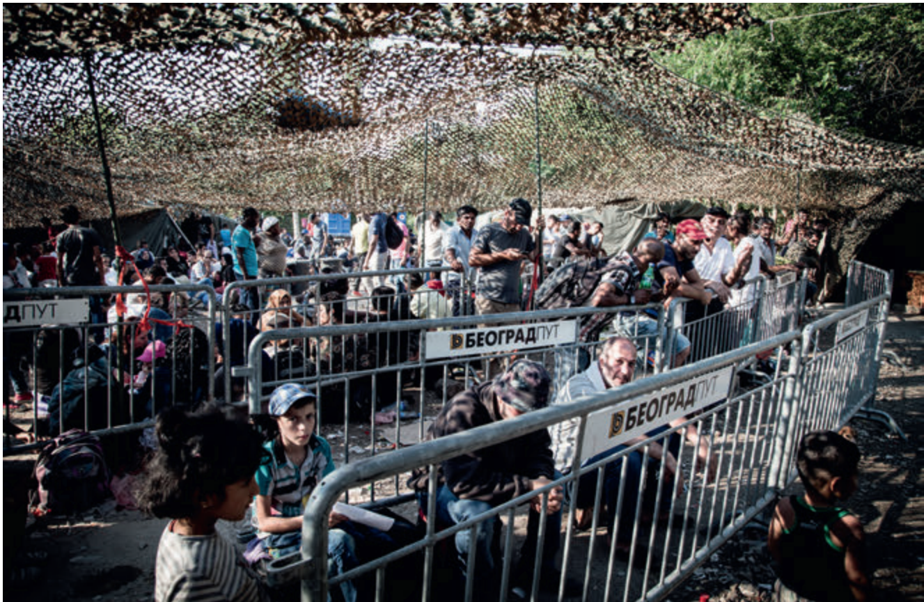
On arrival in Serbia from the Former Yugoslav Republic of Macedonia, people on the move register with the authorities in Persevo.