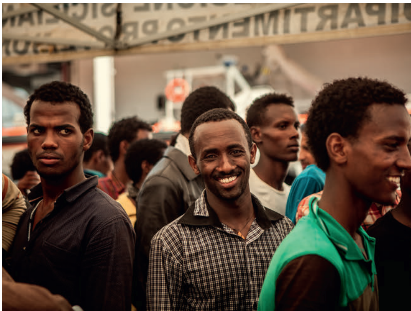
Red Cross volunteers and staff welcome 578 migrants off Italian coastguard boat to the port at Messina, Sicily.