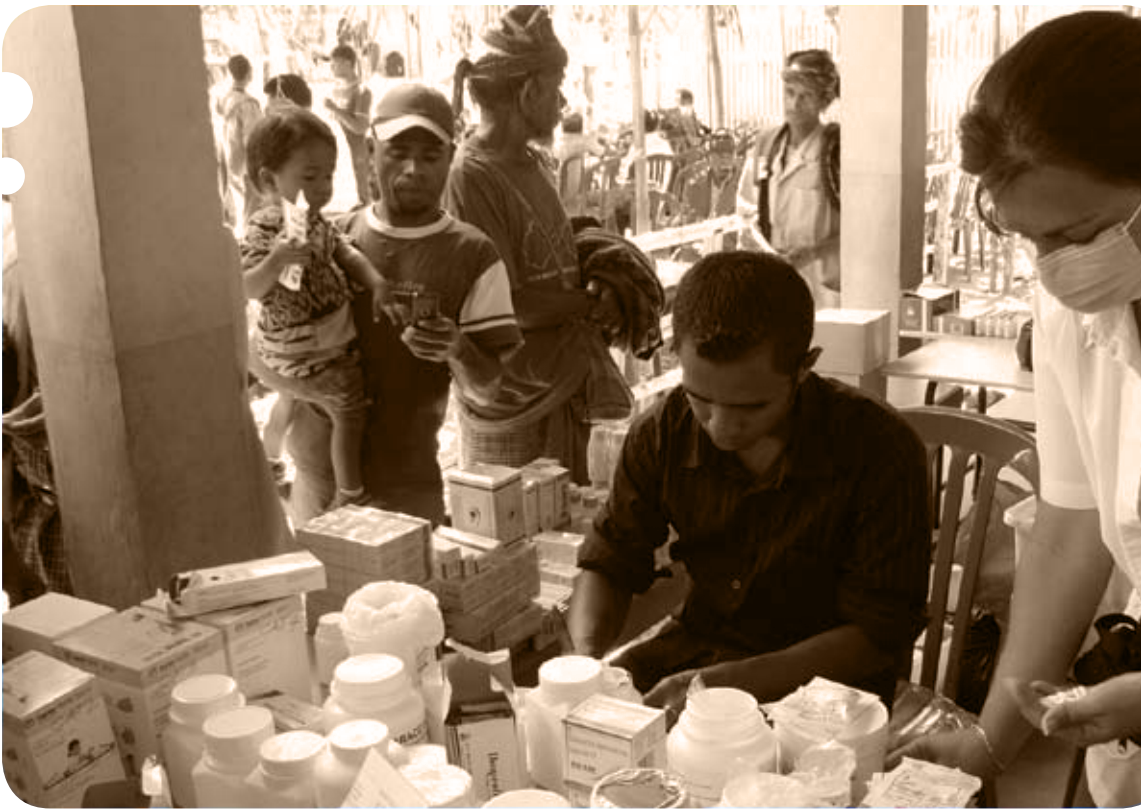
THE “DOTS” APPROACH IS THE CURE FOR TB AND PROLONGS THE EFFECTIVENESS OF TB DRUGS

Yes there are. Weak infection control practices and poor general hygiene in several health-care facilities, especially in resource-limited settings, facilitate emergence and spread of resistant organisms.