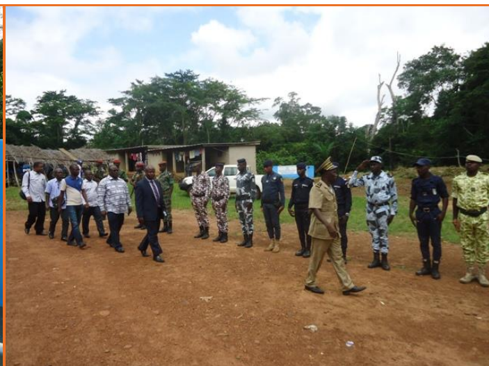
Reception of the well by the regional authorities