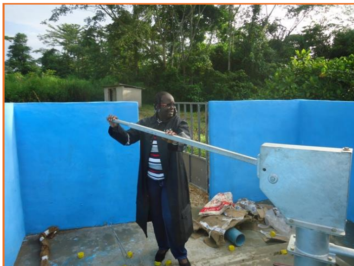
Border Officer testing the well at Gbapleu Entry Point

Furthermore, in close coordination with INHP and Districts Health Directors from Danané and Tabou, 30 health agents have been identified and trained to pilot cross border epidemiologic data collection via smart phones. Ultimately, integrating evidence generated from mobility paradigm and element patterns with epidemiological data will provide for more robust and effective public health interventions, communicable disease response and border health interventions. Data collection will be effective at the time the borders are of reopened.