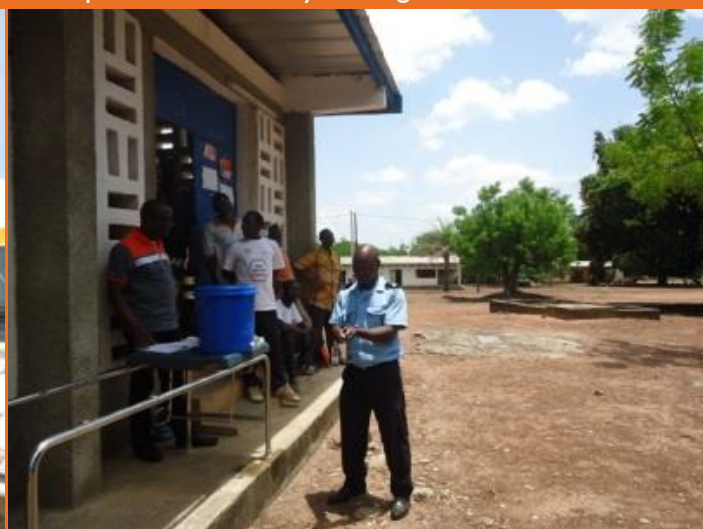
Practical training at a hand-sanitizing station (Odienné)