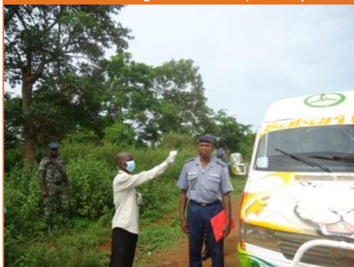
Simulated Health Screening training in Touba