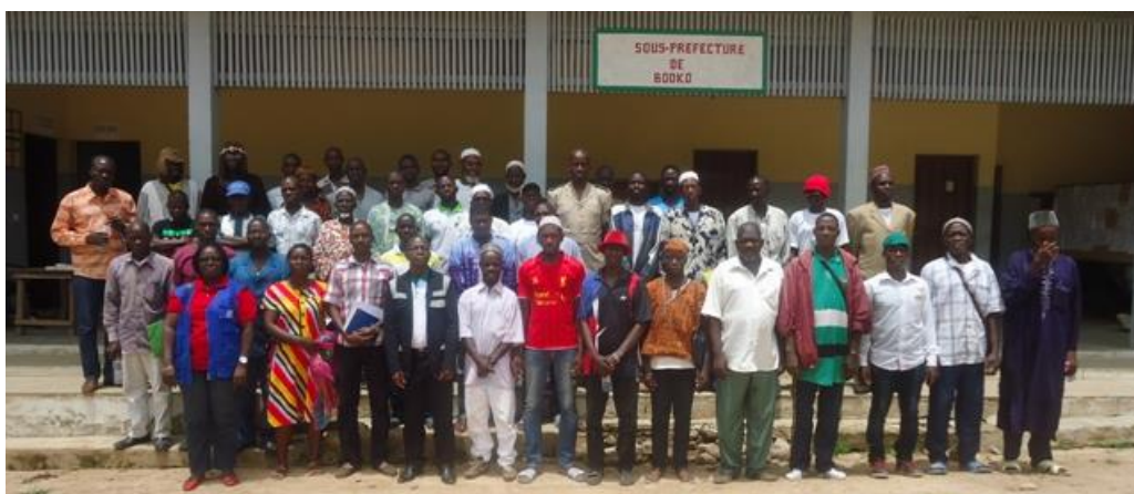
40 key community representatives trained in Booko in August 2015 (Touba Department)

Training sessions were conducted in French and local languages to facilitate role play and interaction. Attendees are now in the process of mobilizing their communities and patients, disseminating messages and information flow and response procedures. Refresher and evaluation training sessions are also currently on going.