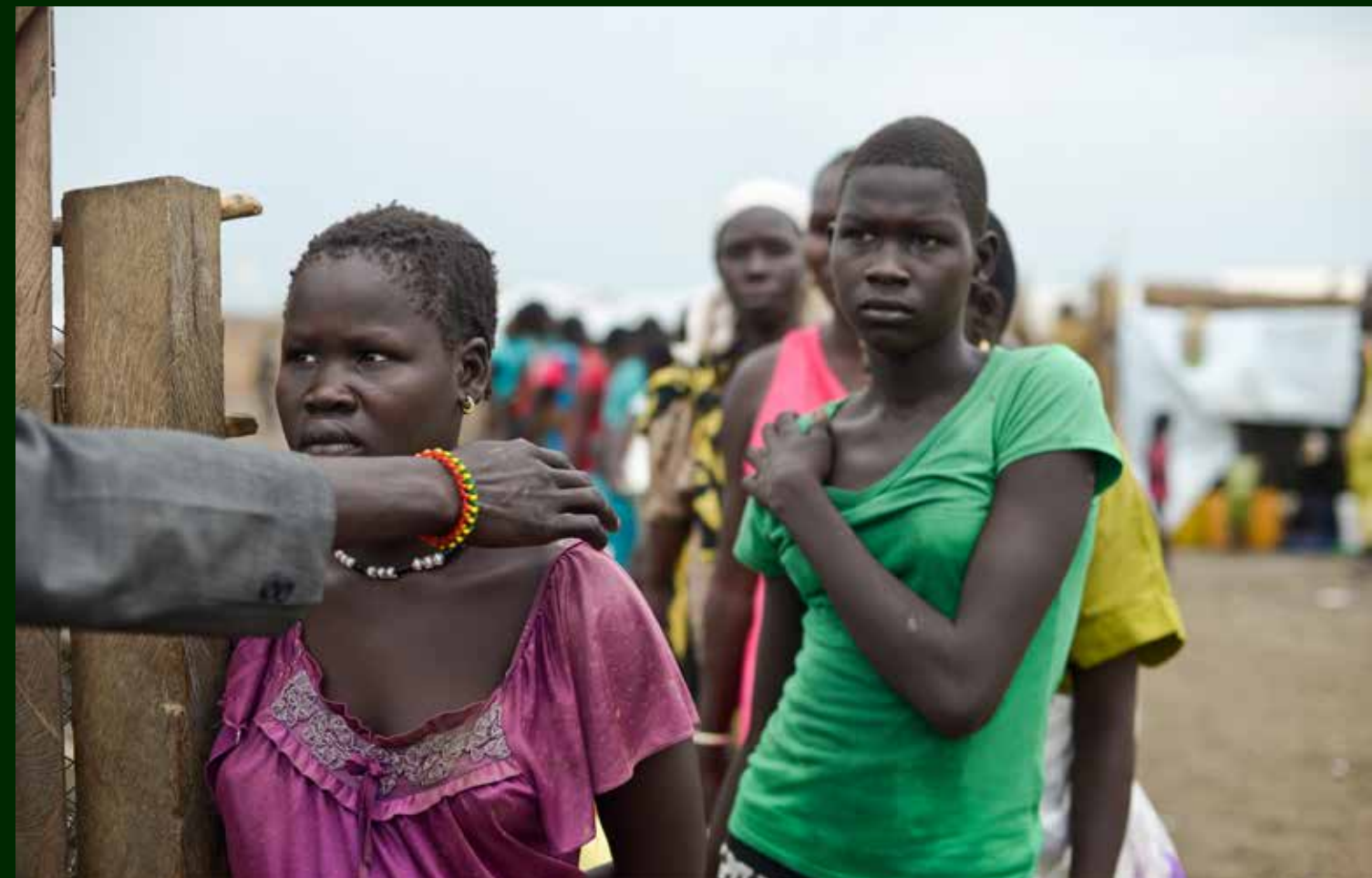
(top) A woman at the front of a line for water in the UNMISS camp near Bentiu is directed to an enclosed water pumping area where demand is high and women must wait in long lines, sometimes for hours even before dawn. There, they are vulnerable to abuse from young men drinking at a nearby market.

Women told Human Rights Watch that often elderly women or pre-adolescent girls are sent to collect wood because they are perceived to face a lower risk of rape than older girls and younger women.