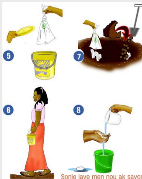
Figure 12: IEC specific to carrying bag from usage point to pit for burial

Buckets were distributed to each household along with weekly supplies of biodegradable bags. One small pit was excavated at the bottom of the hill (public land) and the population were instructed to deposit used bags there. Community mobilisers raised awareness about covering the pit daily with soil and/or ash.