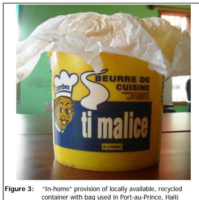
Figure 3: "In-home" provision of locally available, recycled container with bag used in Port-au-Prince, Haiti

Where possible, a container should be used to support the bag for ease of use. Locally available containers, such as those recycled from food or drink packaging, can be used. Ensure the container is both clean and intact (i.e. will not cause bags to tear). Containers must also be sized correctly according to the volume of the bag being used (i.e. stretching bags will cause them to tear).