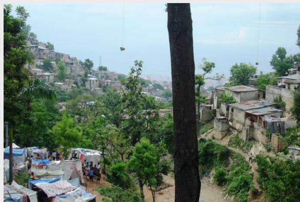
Figure 11: Camp Maranatha, surrounded by a riverbed that experiences flash floods during the summer rains

Camp Maranatha, a spontaneous IDP settlement isolated on a mountainside. It was considered that Oxfam GB would not be able to provide traditional latrines, as the nearest road access is 15 minutes walk over unstable terrain. There was also a land dispute. People were either defecating in the open around the camp, or into plastic bags that were thrown into a nearby ravine.