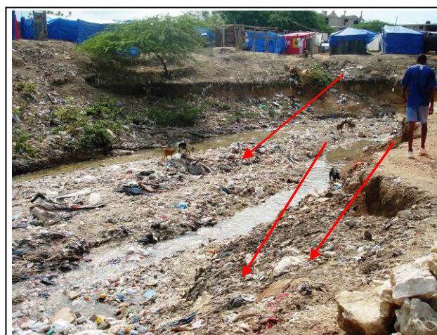
Figure 1: An area used for open defecation by 4,000 plus IDPs for 3 months. Haiti Earthquake, 2009.

http://www.oxfam.org.uk/resources/learning/humanitarian/index.html