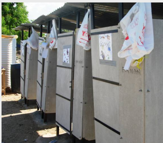
Figure 13: Bag commodes with superstructures

Cité aux Cayes was not accessible by road. A wheelbarrow was used to transport excreta deposit drums and solid waste to the nearest road for pick up.