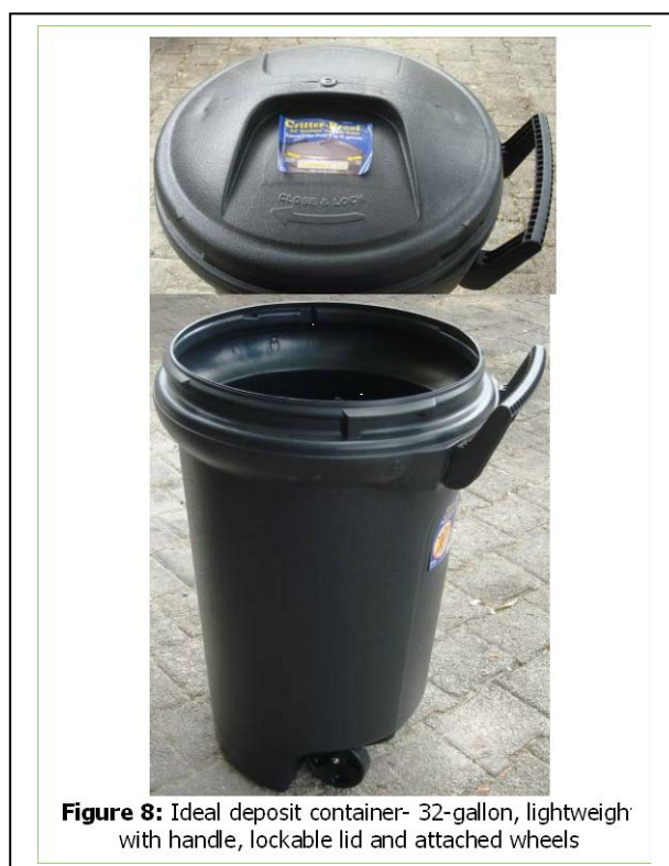
Figure 8: Ideal deposit container- 32-gallon, lightweight with handle, lockable lid and attached wheels

In flood emergencies where populations may be inaccessible, it may not be possible to establish a deposit and storage system. Further research is required into the various bag options in such settings. One option is to bury the bags on-site, providing suitable bag burial locations are available at a suitable distance from people's dwellings (smell) and from water sources (> 30 m). However, this is only recommended for biodegradable bags and is not appropriate in flood prone areas or on land with a high water table.