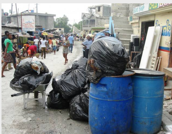
Figure 14: Solid waste and excreta deposit drums being taken to the nearest road for pick up.

Post-trial data collected from household questionnaires found 94% of cabin users were "very satisfied" or "satisfied" with the community toilets. Additionally, 65% of households highlighted "in-home" bags were used by one or more members of the family.