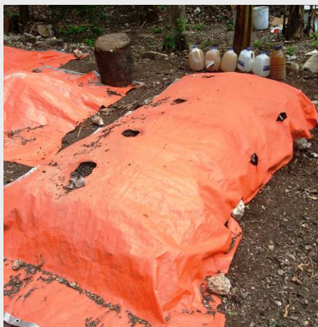
Figure 18: A New Directions Foundation composting site in Port-au-Prince

Two months after the earthquake, the New Directions Foundation set up a pilot-composting project. The system used fungal inoculation in small compost piles on wooden crate-platforms.