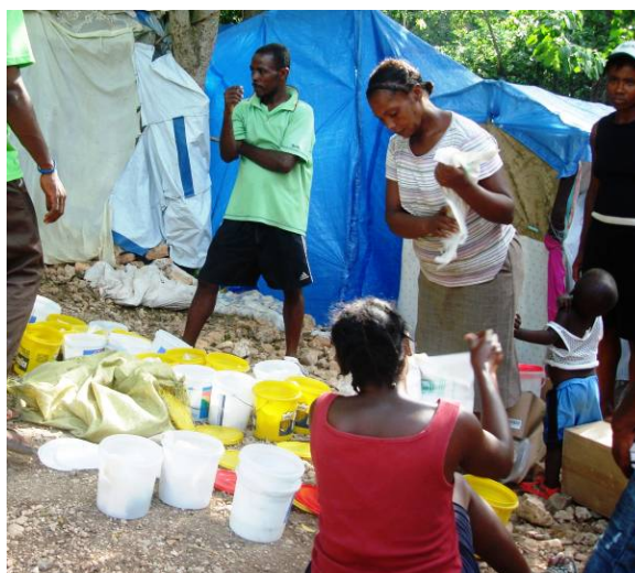
Figure 6: Community-assisted distributions of “in-home” Poo bags. Port-au-Prince, Haiti

If Poo bag approach is to be used for longer periods, the community should be empowered to take on the function of supplying themselves from commercial sources. To prevent the misuse of Poo bags, people should also be made aware of the importance and value of safe excreta disposal in their community. In Haiti, beneficiaries were found using bags for selling charcoal and vegetables.