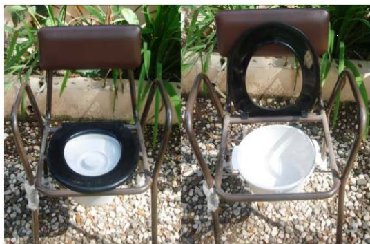
Figure 6: Prefabricated commode (often available in Western nations) requires larger bags; used with a “grocery-style” bag in Port-au-Prince, Haiti