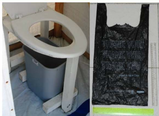
Figure 4: Rapid, low-cost toilet construction (left) by MSF-B for bag (right) used post-EQ in Cité Soliel, Haiti

Where feasible, communal facilities for bag use should also be provided. As a minimum package, an “in-home” system (bags + basic container) can be provided inside a basic superstructure at a communal location. Such a structure offers privacy and comfort for users, and is easy to manage through community toilet attendants. Improved options could include a simple commode system.