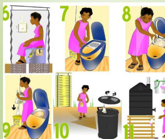
Figure 16: IEC used to explain proper removal of bag from UD toilet and deposit for collection and disposal