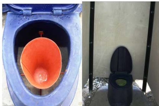
Figure 5: Existing commode with low-cost modification of welded bucket that was the appropriate size of the Peepoo, Port-au-Prince, Haiti