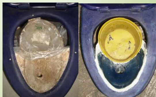
Figure 15: Low-cost, locally produced UD toilets (Left, fibreglass, right recycled materials)

Instead of providing separate urinals, to maximize the space available and minimize the number of bag used, Oxfam GB developed Urine Diversion (UD)-bag toilets. The urine was diverted to a soak pit and the back "bucket" style was used as with other bag systems, to contain faeces.