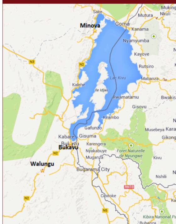
Figure 1. Map of Project Sites

by beneficiaries followed the CAMPS model of service disbursement, with many first receiving psychosocial assistance, followed by medical care, and then socio-economic support. Not all beneficiaries received all services; no one interviewed had received legal assistance. A semi-structured qualitative questionnaire was administered to participants to examine their experiences with CAMPS, their suggestions for improvements, and their opinions on the strengths and weaknesses of the services.