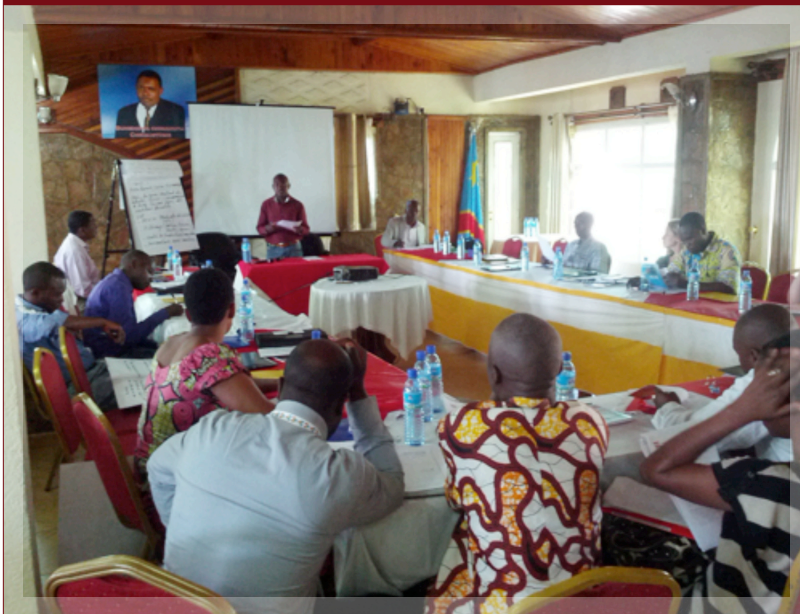
Figure 2. Conference Attendees Listen to a Presentation by a Participant Following a Breakout Session in Bukavu

to break into two different breakout sessions. In the first session, participants split into groups by one of the four programmatic areas – medical, psychosocial, economic or legal – and discussed project findings related to their field of expertise. In the second breakout session, participants split into four groups with mixed expertise and each group discussed three overarching questions related to some of the challenges that arose from the data, and how they have overcome or would suggest overcoming these challenges. The discussion questions presented in the breakout sessions can be found in Appendix 4.