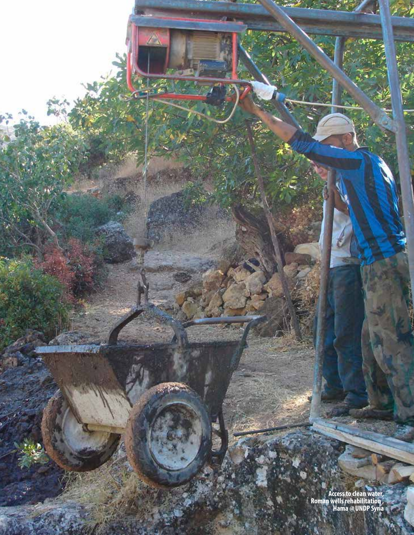
Access to clean water, Roman wells rehabilitation, Hama @ UNDP Syria