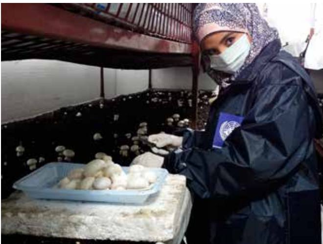
Mushroom cultivation - Homs