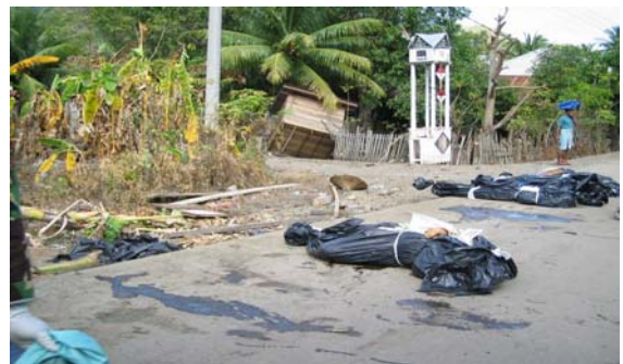
Tsunami fatalities (2004), Indonesia (WHO)