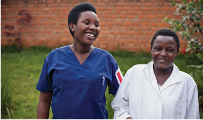
Photo Above: One of LifeNet's Nurse Trainers with a clinician at a franchised clinic.

At the same time, a conversion franchise model allows us to work in partnership with local organizations, developing local leadership and local initiative. It's an amazing thing to witness our partners internalize the learnings and trainings, and watch them transform. We've seen many examples of this through our partnerships. It's a different kind of trade-off, and one that we are happy to make.