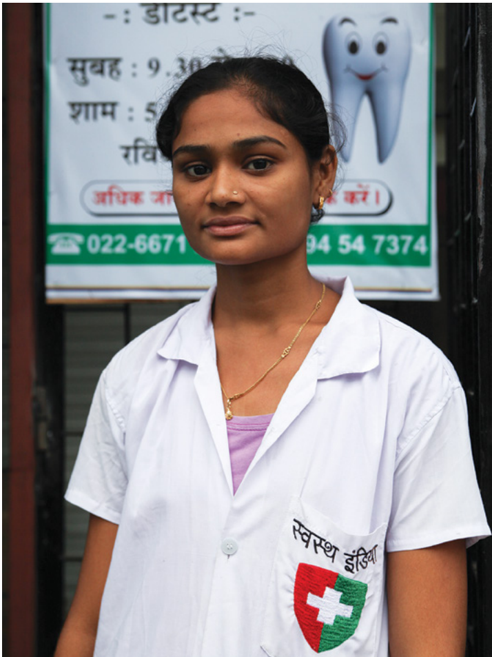
Photo Above: A young nurse at the Swasth Dental Health Clinic in a slum area of Goregaon.

know that someone is watching. Over time, this changes behavior because everyone knows it's not professional to be late. You don't have to tell them that; they know. The information systems we have allow us to get very micro in the level of detail and insight, which helps us run the organization at a macro level more effectively.