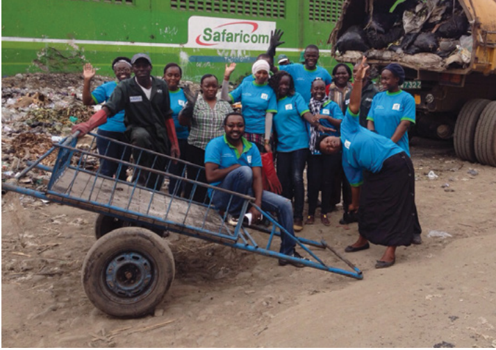
Photo Above: Access Afya staff and volunteers posing with the trash they collected after a community cleanup activity in the Jamaica Village neighborhood of Nairobi.

fuller spectrum of primary care. Our clinics offer a wide range of services instead of focusing on a specific intervention, which many other programs targeting low-income communities do. We treat primary care as a first access point to the healthcare system and see it as the intervention most needed in a community with poor access to clean water, sanitary toilets, nutritious foods, and clean air. By focusing on holistic primary care, we focus on keeping patients well, rather than treating them when they are already sick , a type of care that generally isn't available in Nairobi's informal settlements.