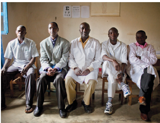
Photo Above: Clinicians at a clinic in Burundi franchised by LifeNet International.

Given the importance of primary health care, the question arises of how, as practitioners and innovators, we can all make our own organizations more effective and efficient at providing quality health care to our patients. The following chapters outline key challenges and solutions we have found helpful in our own organizations.