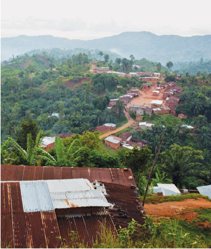
Photo Above: A village where one of LifeNet International's partner clinics is located.

This is usually the meeting in which there is a real understanding in the partnership and what we do. We then ask whether they would like to sign on for the next year and go from there. At this point, we have a waiting list of about twenty clinics.