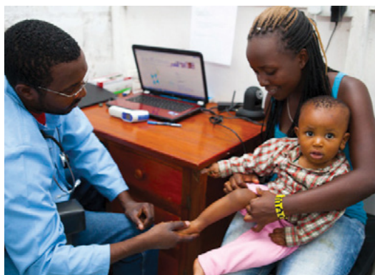
Photo Above: A patient consults with a clinical officer at Access Afya's clinic in Kisii Village in Mukuru, Nairobi.

Good primary care reduces the burden on secondary and tertiary care systems. As many of us can attest, a vast majority of the health care needs of any family are primary care needs. Secondary care needs are less common, and tertiary care needs are rare. With good primary care, the frequency of accessing secondary and tertiary care reduces, as most conditions are