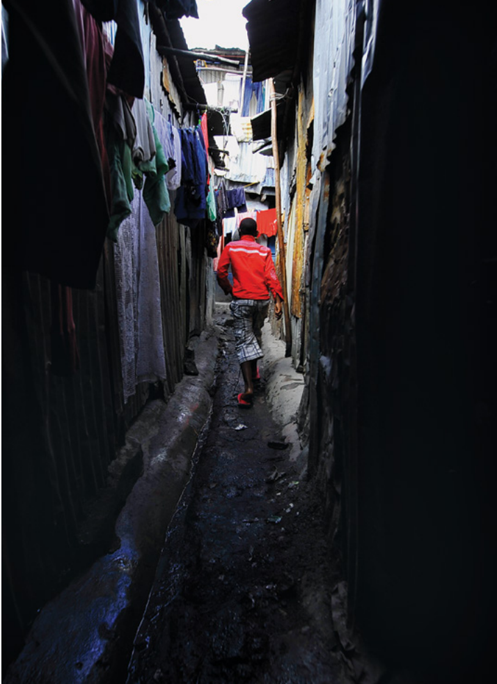
Photo Above: An alley, in the Mukuru slum, near one of Access Afya's clinics.

In addition, we have used the community surveys to obtain real data to design membership packages based on the wants and needs of the community. Questions on the survey form teach us about our target market, with questions such as: What savings methods do you currently use? What features would you value in a membership program? How do you teach others about health? This helps us to intentionally design products and services that meet exactly what our target community wants. For example, regarding the membership program, potential clients gave us great answers not only on the membership card features they liked, but also on how they currently use our clinic and on how they think the membership should be priced.