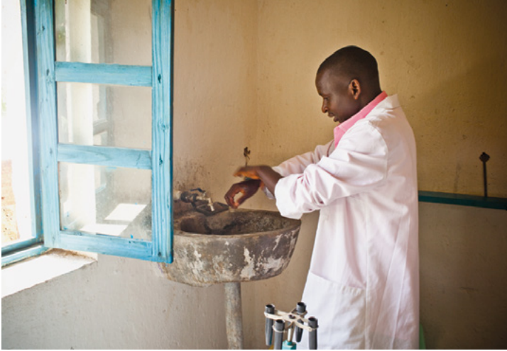
Photo Above: A clinician at one of LifeNet’s partner clinics washing his hands, one of the basics of healthcare which is taught in LifeNet’s curriculum.

information is understood and implemented, while building a rapport with providers. Beyond these on-site visits, our nurse trainers will also follow-up with regular phone calls.