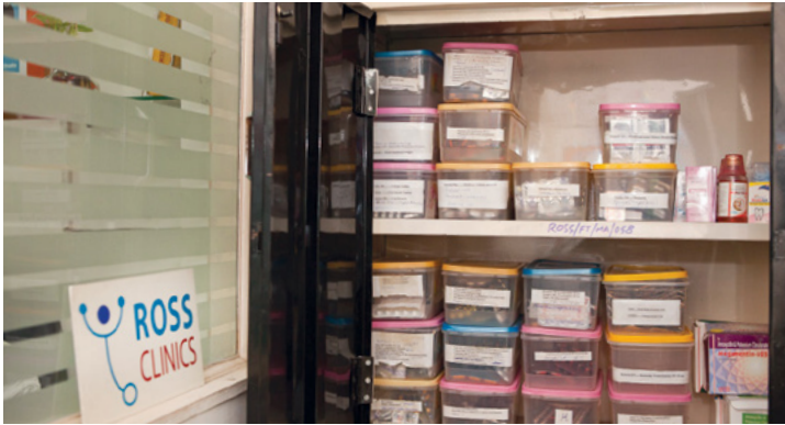
Photo Above: Supply organization at Ross Clinics.

There are a few major drivers that lead to these challenges. The biggest is variability. Since we are dealing with urgent care, there is large variability in patient footfall and sale of medicines. There is variability day-to-day: one day we might have thirty patients, while the next day we might have ten. There is variability in disease patterns as well. If we see a lot of patients with viral fever one week and decide to stock more of those medicines, there is no guarantee that we'll see any more viral fever patients the following week. Of course, there is also seasonal variability, where we see increased footfall of certain kinds and in certain clinics. There is also variability in the prescriptions of doctors themselves; some doctors have their own favorite antibiotics, antacids, and pain killers. However, for the most part, we can predict seasonable variability and variability in doctors' prescriptions. It's the day-to-day variability that is the most difficult to predict.