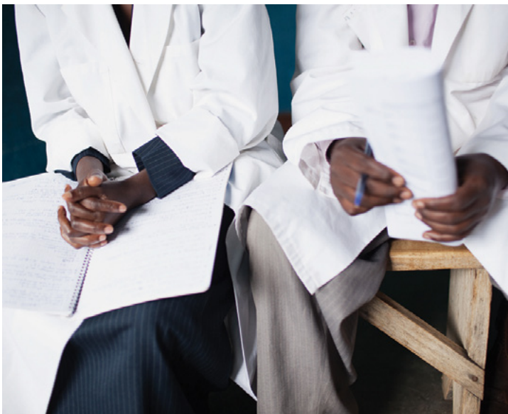
Photo Above: Clinicians in the middle of a training at a LifeNet partner clinic in Burundi.

Swasth (India): Agreed. We have also found "shaming" / criticizing to be better one on one and recognition in a group