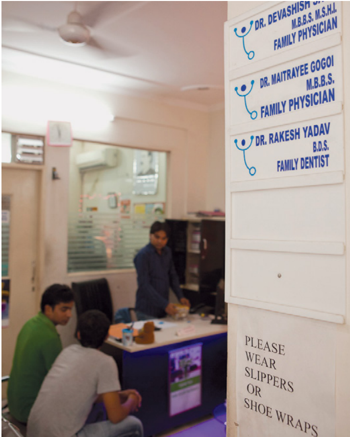
Photo Above: The names of several physicians are prominently displayed in on of Ross Clinics' waiting rooms.

of them prefer to work seven days a week for around a month and a half and then take fifteen days of leave all at once to go spend more time with their families. On the doctors' side, many of them are generally willing to work their shifts for all seven days a week, but for those who aren't, we'll get a locum (temporary) doctor who can fill in one or two days a week for vacations and emergencies.