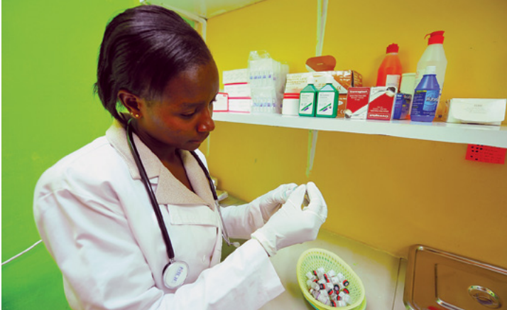
Photo Above: A clinical officer at Access Afya examines their drug supply.

doctors . Therefore, we've now created a new Access Afya "mascot" that is a mannequin dressed as a doctor that stands outside of each of our clinics! This is a funny attention grabber that also helps communicate that we are more than just a pharmacy.