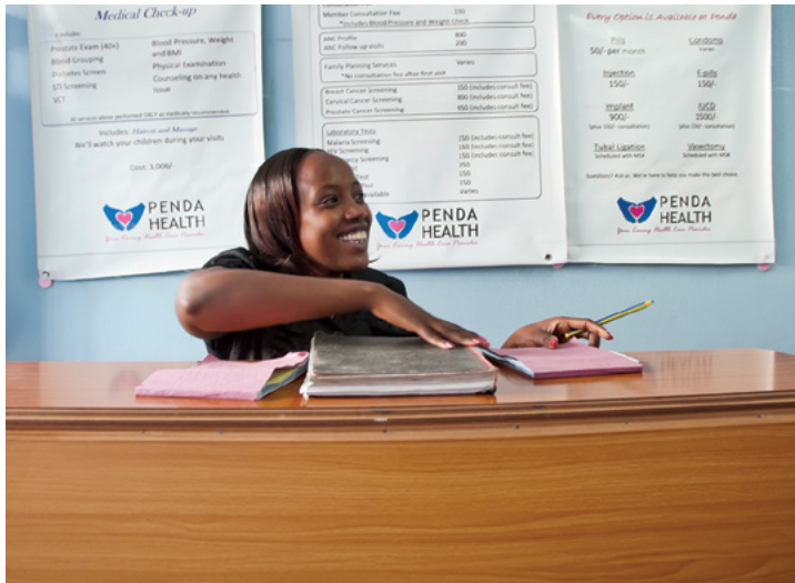
Photo Above: A receptionist at one of Penda's medical centers.

also help us get feedback on how our individual providers are performing on patient-provider interaction.