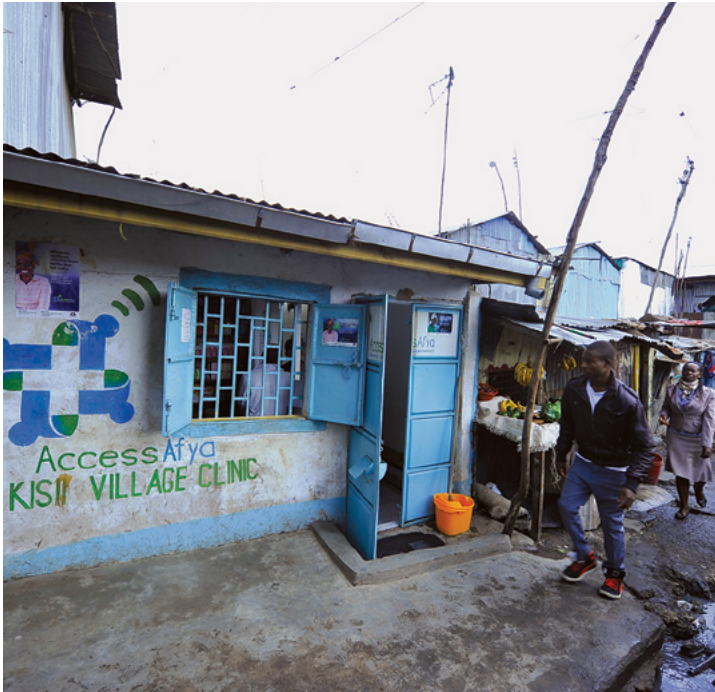
Photo Above: One of Access Afya's clinics in the Mukuru slum in Nairobi.

Finally, we use our Brand Ambassador Program as a feedback loop to gain deeper insight about our brand and model. In this program, we specifically work with community health workers who are already referring to Access Afya, rather than trying to attract referrals through an incentive scheme so that our brand ambassadors truly believe in Access Afya and its value. We provide the brand ambassadors with special cards, t-shirts, and information on Access Afya's services so they can share Access Afya's products and services with fellow community members, neighbors, and friends. Over a monthly team meeting, we meet with our ambassadors to learn from their experiences in the field and hear what customers and community members are saying about Access Afya. The feedback, ideas, and opinions from these meetings are then shared with management and the clinics, and discussed at weekly staff meetings as opportunities to enhance or improve our services to better meet the wants and needs of the community.