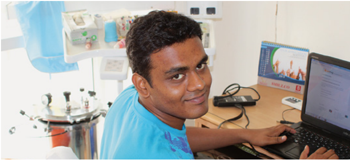
Photo Above: A student helping Ross Clinics to set up their drug dispensing system.

the organization. In disconnected systems with multiple clinics like ours, a tool like Google Docs is really helpful for improving day-to-day supervision and accountability.