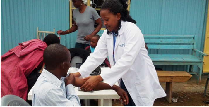
Photo Above: One of Penda's providers provides a health check-up during a community engagement event.

We also spend a lot of time screening our providers to find doctors, clinical officers, and nurses who are non-judgmental. In particular, we offer free medical education trainings to non-Penda health professionals, and use those to help identify potential hires. We feel that simply by coming to these non-required trainings, these providers are showing an intrinsic motivation to provide high-quality, patient-centered care. We then also look specifically for providers at the trainings who are particularly engaged and ask particularly good questions.