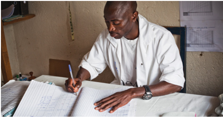
Photo Above: A clinician at one of LifeNet International's partner clinics records data.

see fit; freedom for non-governmental clinics to hire and fire (even if they are Ministry of Health staff); a speedy and simplified approval process of programs and memorandums of understanding (MOUs) with the Ministry of Health; imports of medicine and medical equipment exonerated from duties, etc. As we continue to expand to other countries, elements such as whether to charge a franchise fee and the ability to sell things like eye glasses differ depending on legal frameworks in that country. In Uganda where there is a requirement for continuing medical education (CME) for medical professionals, for instance, we plan to get certified as a registered provider of CME and then charge a monetary franchise fee for providing this CME.