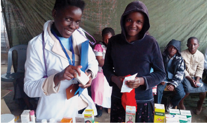
Photo Above: A Penda clinician organizes medicines at a community event.

Another question that has surfaced is whether we should have the same set of services at all of our clinics. Overall, we're aiming to have the same set of services across our facilities. However, there are a number