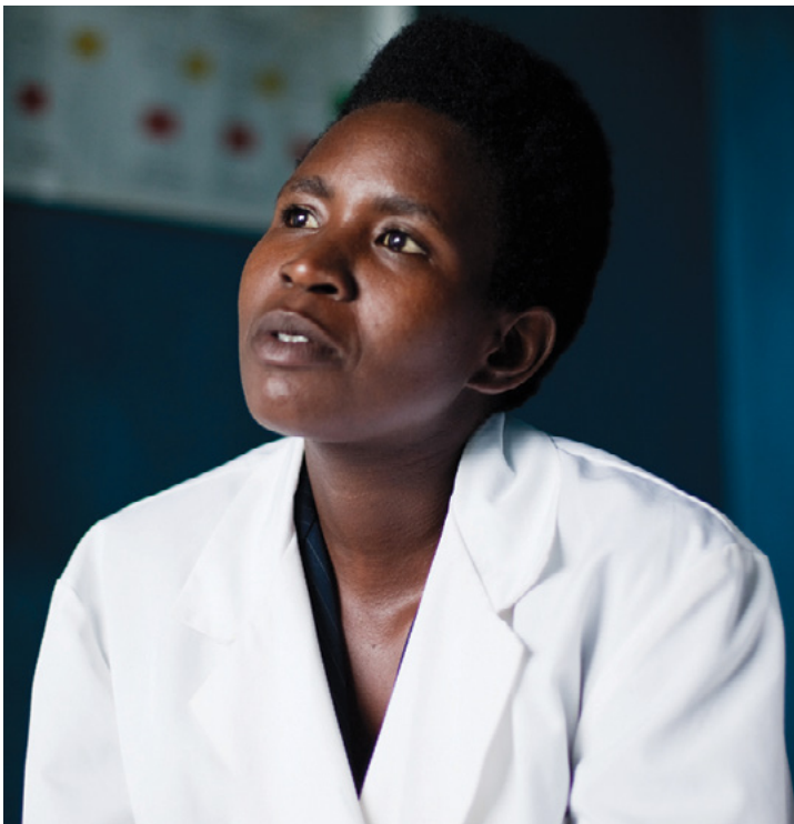
Photo Above: A clinician at a clinic franchised by LifeNet International.

Franchising is a good way to go when you are faced with limited resources, and you see that the existing resources can be leveraged and improved. It also takes advantage of the existing client loads of established clinics.