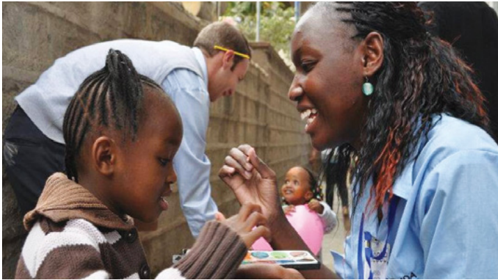
Photo Above: Patients receiving a typical Penda welcome with warm smiles and free pink balloon.

Another important aspect of the patient experience for Penda is the follow-up call. The follow-up calls are done by our providers who call back every patient after three days and ask them three things: “How are you doing? Are you feeling better? And have you had to go anywhere else to get additional care or medications?” These calls have three main benefits. First, our patients love it that we care enough to call and make sure that they’re getting better. Second, the calls really build the relationship between the provider and the patient. And finally, the calls help us ensure that our patients actually are getting better and if they’re not, we can bring them back in for a free follow-up consultation.