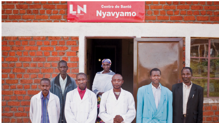
Photo Above: Staff and clinicians in front of one of a clinic in Burundi franchised by LifeNet International.