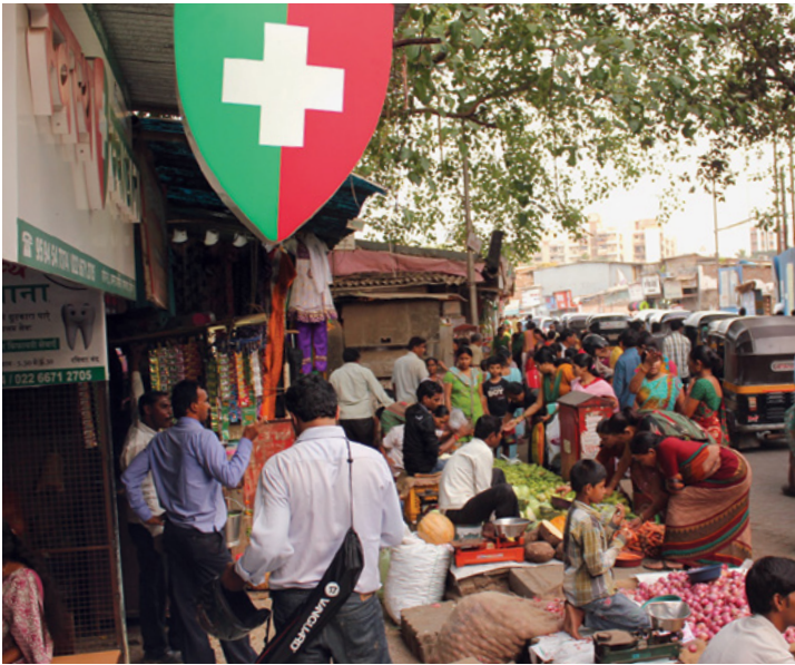
Photo Above: One of Swasth India's clinics located in front of a local bazaar in Mumbai.

Our experience has shown that the location of a clinic is a key ingredient for success. A poorly placed clinic will have slim hopes for becoming sustainable and viable. Nevertheless, our experience opening 21 clinics over the past three years (6 of which have closed) has indicated that clinic placement is a highly subjective decision, and there doesn't seem to be any hard formula to get it right in different contexts. Still, reflecting on our experiences, we are able to identify some important tips and guiding principles which I will share here.