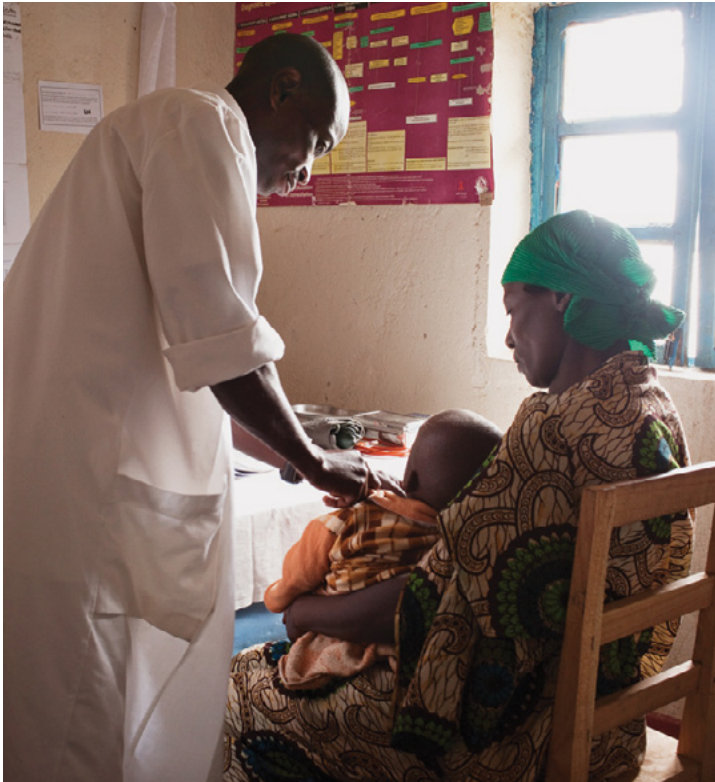
Photo Above: A clinician sees a patient at a clinic franchised by LifeNet International.

with other people you're working with. It's not something that helps build a team. Sometimes this is counter-cultural, so it's something we have to work on together. We try to encourage our nurse trainers to be helpful and ensure that they're not being a burden. Instead of sitting there and reprimanding them in front of a patient, "Why aren't you washing your hands?" we encourage them to try to help instead. We've found this idea of "working together" to be crucial in both instilling and sustaining behavior change and quality improvement.