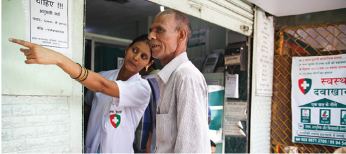
Photo Above: A nurse at a Swasth Health Clinic points to the newly opened Swasth Dental Care Clinic next door in the slums in Goregaon.

to the severity of their condition — result in a cheaper visit, and that, since we offer lab tests and drugs, patients can access everything they need under one roof. As a result, we've found that patients will come to the area to visit their previous doctor but end up choosing us.