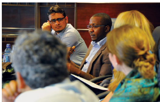
Photo Above: Members of the Primary Care Learning Collaborative discuss site visits in Nairobi, Kenya.

For many of its members, the Learning Collaborative has been a unique opportunity to have frank and