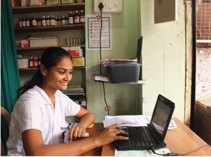
Photo Above: A Swasth staff member uses the organization's back-end IT system.

As we were developing this information system, one question we asked ourselves was whether to run this from laptops or other devices, such as mobile phones or tablets. This depends on an organization's priorities. For us, cost matters because we are focused on serving patients living in Bombay's slums. Tablets are more expensive than laptops; a basic laptop is cheaper yet more powerful. For us, operating in an urban slum, a laptop offered more flexibility than options like mobile phones , though a provider in a rural setting may find using mobile phones more beneficial. It all depends on the environment.