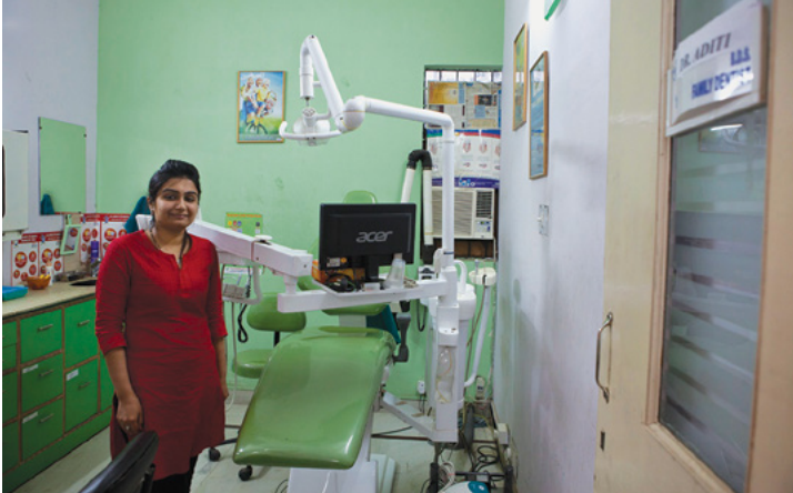
Photo Above: A Ross Clinics' dentist in the dental room of one of their clinics.

up to see why they are not doing certain types of work? The person will be alone for most of the day, so it is quite important that they are highly motivated. Are they willing to learn? There is huge learning that happens in the first fifteen days. Are they able to handle multiple things at the same time? Are they good communicators and able to form strong relationships with patients quickly? We give these factors at least the same weight as a candidate's clinical skills, if not more, and we have been fortunate to find doctors and clinic managers who are eager to learn, have strong communications skills, and believe in the importance of responsible primary care that doesn't involve unnecessary tests or medicines.