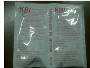
15 ORS sachets