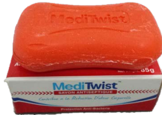
6 small soap