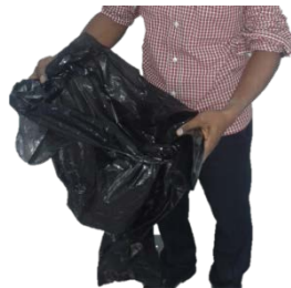
5 Garbage bags