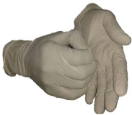
10 Examination Gloves