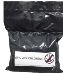
480g Chlorine powder