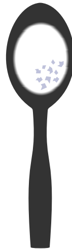
A little less than 1 TABLESPOON