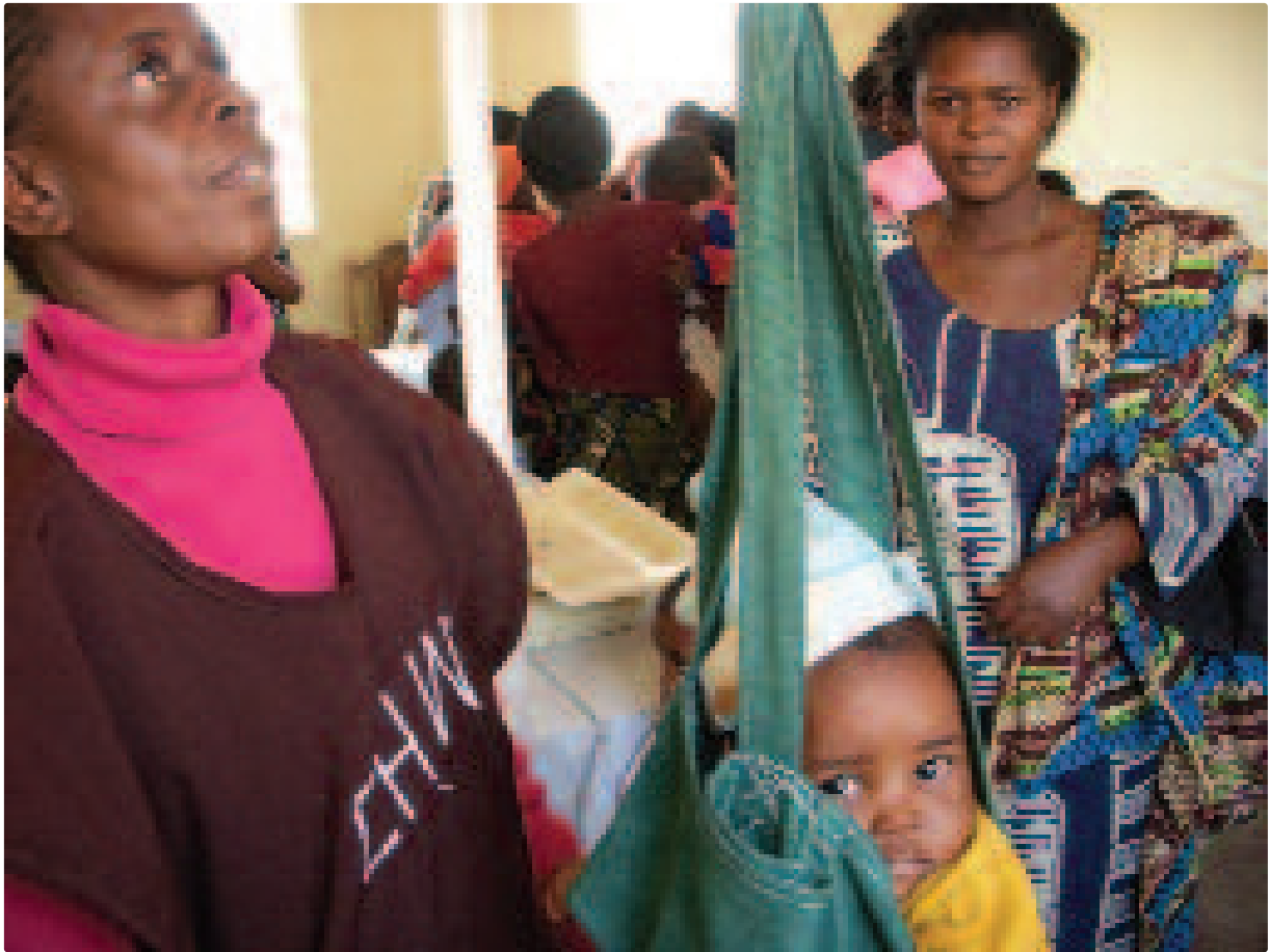
Families flock to Child Health Week in Zambia

which relies on the joint annual reviews, although a set of HRH-specific indicators are developed for this plan. It is important that the data for the specific indicators proposed for the HRHSP 2011–2015, as far as possible, are collected as part of the general monitoring and evaluation system. In particular there must be an alignment between the HRHSP monitoring and the joint annual review monitoring of the HRHSP 2011–2015 objectives, strategies, activities and indicators.