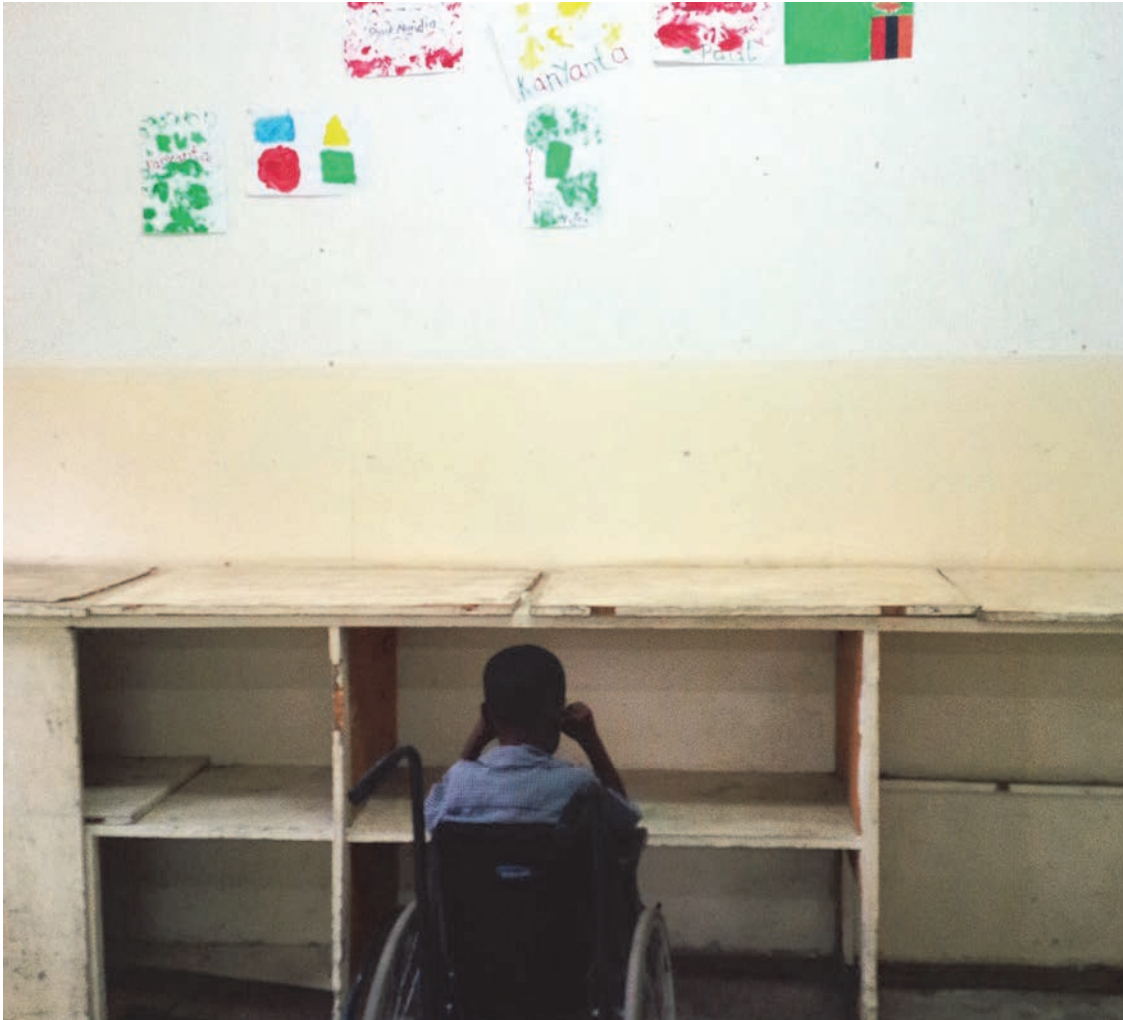
Child with physical disability in a special education facility in Ndola.

Special education teachers and head teachers also told Human Rights Watch that while their schools provide peer-based extra-curricular HIV prevention education to students through programs such as “Anti-AIDS Clubs” or “Safe Love Clubs,” special education teachers are typically not involved in such initiatives and children with disabilities are often not encouraged to participate in these activities. 86 As one teacher for deaf students said: “Sexuality and HIV education is just for the hearing and their teachers.” 87 Of the 44 students with disabilities interviewed, only a few had participated in such clubs. 88 Special education teachers and students with disabilities are also typically excluded from special