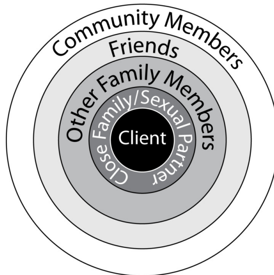
Figure 7.1: Disclosure circles

Source: Colton, T., Costa, C., Twyman, P., Westra, L., and Abrams, E. (2009). Comprehensive peer educator training curriculum, Trainer manual, Version 1.0 . ICAP.