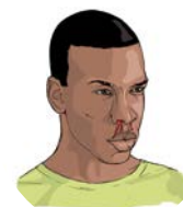
Unexplained bleeding or bruising

Go to an Ebola Treatment Unit Now. It could SAVE your LIFE .