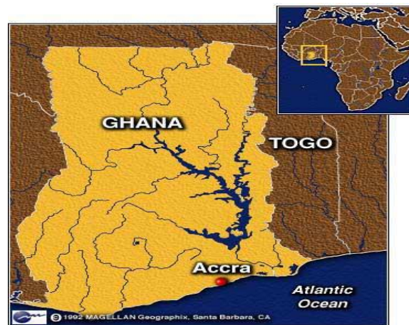
Figure 1: Map of Ghana: Showing Location

Half of the country lies less than 152 meters (500 ft.) above sea level, and the highest point is 883 meters (2,900 ft.). The 537-kilometer (334-mi.) coastline is mostly a low, sandy shore backed by plains and scrub and intersected by several rivers and streams, most of which are navigable only by canoe. A tropical rain forest belt, broken by heavily forested hills and many streams and rivers, extends northward from the shore, near the Cote d'Ivoire frontier. This area, produces most of the country's cocoa, minerals, and timber. North of this belt, the country varies from 91 to 396 meters (300-1,300 ft.) above sea level and is covered by low bush, park-like savannah, and grassy plains.