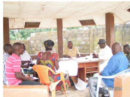
Plenary sessions and Group presentation (below)