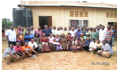
Figure 3. Cross section of Parishioners in attendance