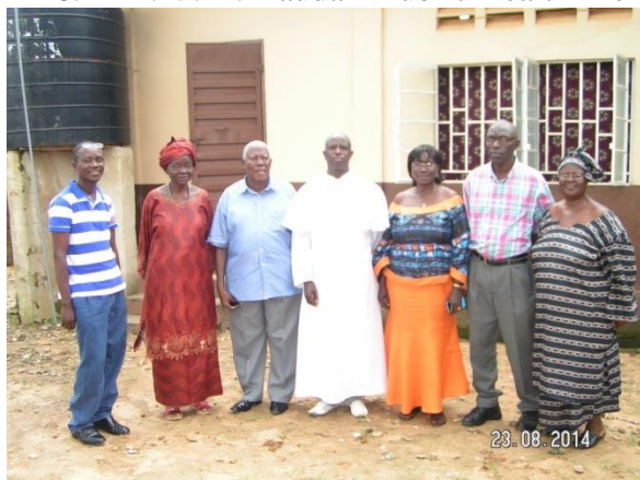
Figure 4. Batch of Facilitators pose for photo