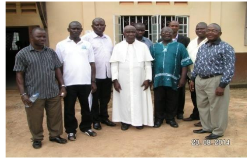
Figure 1. Parish Priests in attendance 19th - 20th session

The participants for the training comprised Parish priests, PPC Chairpersons, CMA chairpersons, CWA chairpersons, CYO presidents, Catechists, and Leaders of Diocesan Organisations from all parishes under the Catholic Diocese of Bo. (See attached attendance registers).