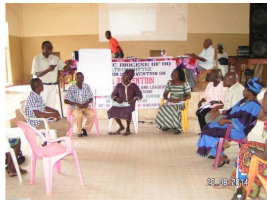
Figure 11. Participants take part in practical session on Focus Group Discussion