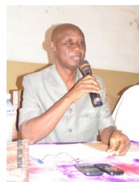
Figure 7. His Worship, The Mayor of Bo City, Chairperson for second session of the trainings

He concluded by calling on all to accept Ebola and prepare to face the reality in stepping up prevention advice, upon which he declared the Workshop open, as Chairman of the Meeting.