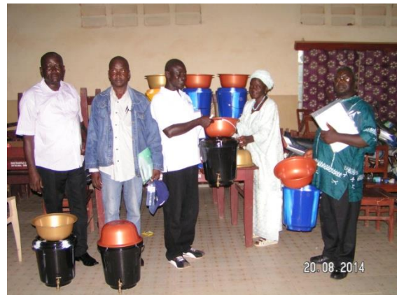
Figure 13. Participants receiving chlorine kits