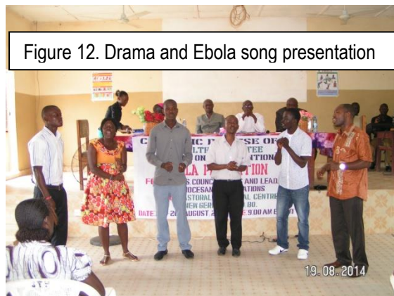
Figure 12. Drama and Ebola song presentation