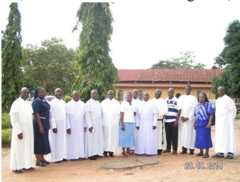
Figure 2. Parish Priests in attendance 22nd - 23rd session