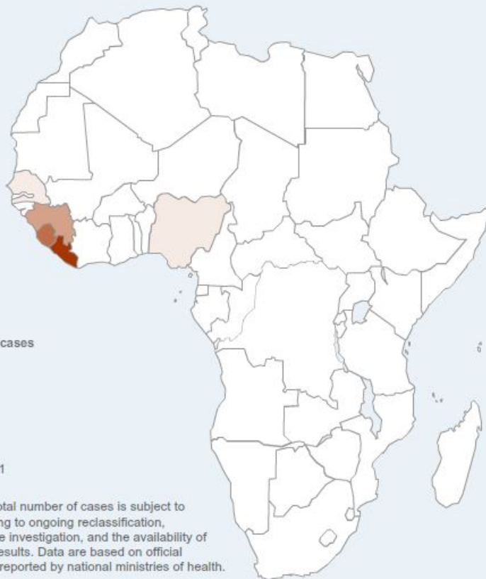
Number of cases