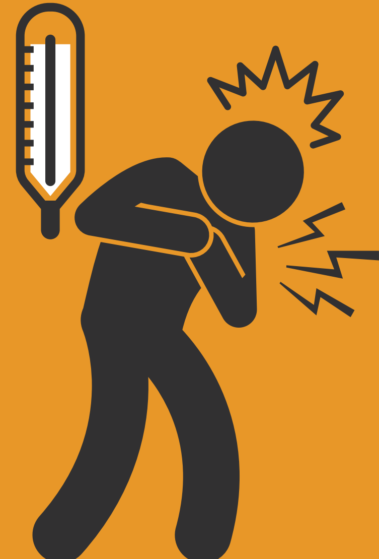
ANY NEW PATIENT RESTARTS PROCESS