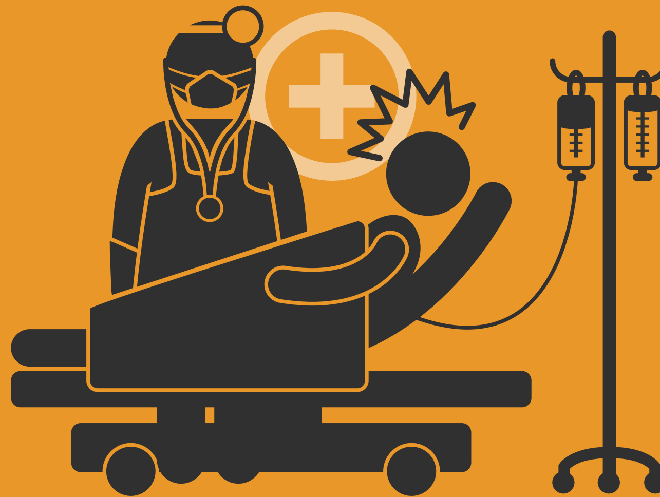
PATIENT INTERVIEW FOR CONTACTS