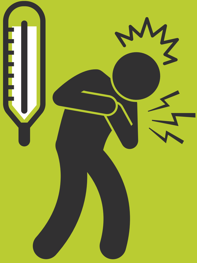
FEVER AND SYMPTOMS