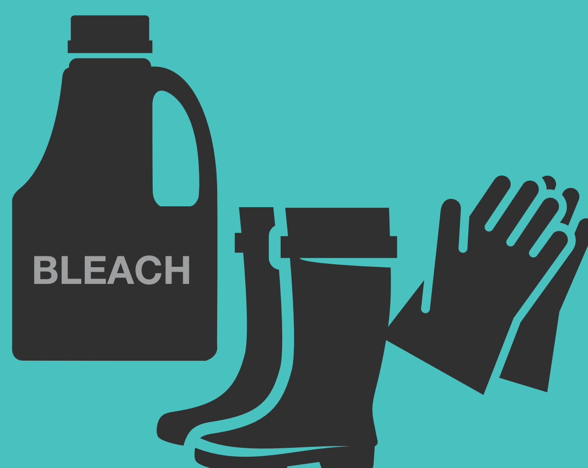
SAFE BURIAL PRACTICES