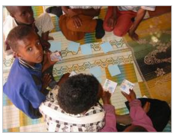
Step 2: Problem Identification

This step is meant as an icebreaker and allows the children to become familiar with the methods they will use. The children introduce themselves with the help of the puppet Luuf , which is combined with the introduction of the facilitators, the objectives of the course, the characters and the tools. A second activity allows the children to reflect on their daily lives by telling stories with the help of drawings. To make it more suitable for children, the storytelling can be linked with the coloring of drawings.