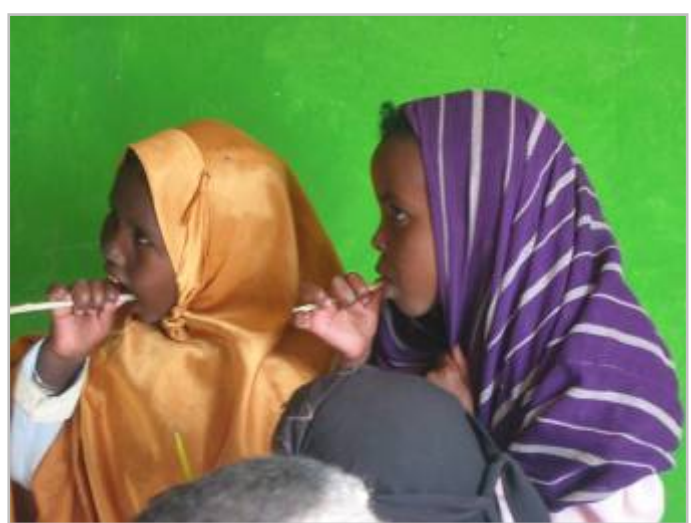
Step 4: Practising Good Behaviour

Activities: 1. Review (un) healthy habits 2. How germs are spread 3. Flies spread germs Activity 1 reviews the problem identification using a game. Activity 2 and 3 explain some of the common diseases that children can suffer from. This is done through telling a short story on the basis of posters, and a role-play done by some of the children after instruction from the facilitators.